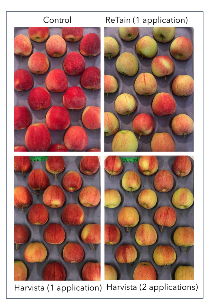
Figure 3. 'Gala' fruit coloration at harvest as influenced by different treatments. A single application of ReTain and a double application of Harvista significantly reduced red color development, while a single Harvista application had minimal impact compared to the untreated control.