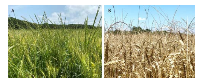
Figure 2. Italian ryegrass in wheat field (A) before maturity, (B) after maturity

Figure 1. Identifying characteristics of Italian ryegrass, A) presence of auricles, B) prominent lines on leaves, and C) representation of Italian ryegrass infestation in wheat field