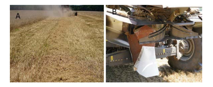
Figure 3. A) Weed seeds and chaff narrowed down into a line during wheat harvest, B) Chaff liner fixed behind the harvester to concentrate chaff and weed seeds therein.

the soil are either disintegrate, lose viability or eaten up by predators. Reports indicated that more than 95% of the Italian ryegrass seeds buried in soil become non-viable within 540 days, regardless of burial depth (Cechin et al. 2020).