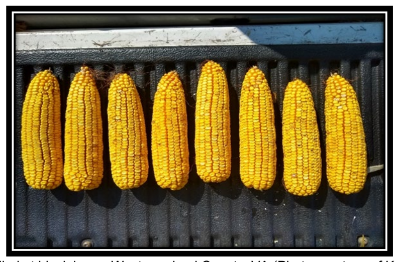
Figure 4. Corn ears pulled at black layer--Westmoreland County, VA

Eight ears of corn were pulled randomly from the field at black layer (see picture below.) Ears were filled completely, indicating that nitrogen was not deficient.