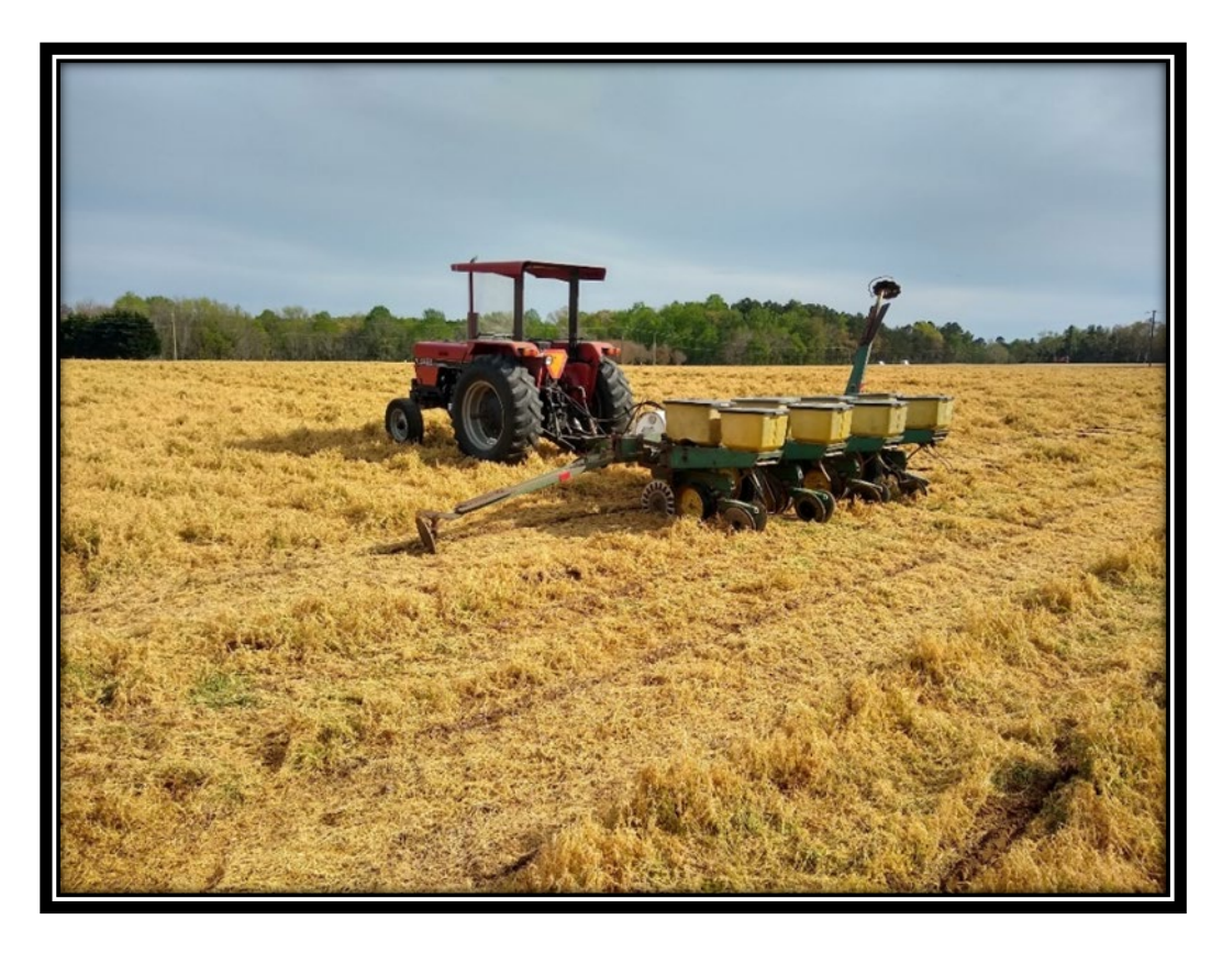
Figure 1 . Planting corn into hairy vetch cover crop 4/22/2022 in Westmoreland County, VA

Hairy vetch cover crops were established on both farms following full-season soybeans using a no-till drill and seeded at approximately 20 pounds per acre in mid-October. The Westmoreland County site was fertilized with 14-65-60 per acre using monoammonium phosphate and muriate of potash in early March to stimulate hairy vetch growth and provide phosphorous and potassium for the corn crop. The cover crop was terminated on April 13th, about two weeks prior to the optimal termination date. Based on the amount of growth of the hairy vetch, it was estimated that 80 pounds of plant available nitrogen per acre would be available to the corn crop. Corn was planted on April 22nd (see picture below) at approximately 26,000 seeds per acre in 36-inch rows. Ninety pounds per acre of nitrogen and 11.25 pounds per acre of sulfur were broadcast in the burndown herbicide carrier. The corn crop received no additional fertilizer.