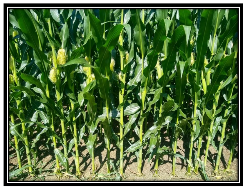
Figure 3 . Corn following hairy vetch cover crop-July 4th, Westmoreland County, VA

Ear leaf tissue samples were taken at the Westmoreland site on July 4<sup>th</sup> for tissue sample analysis. Corn looked very good at that time. See figure 3 below. All nutrient levels were in the sufficient range, except boron which was 4 ppm, considered low by some laboratories. Nitrogen was 2.91%, considered to be on the low end of the sufficient range. No visual nitrogen deficiency symptoms were observed during the growing season.