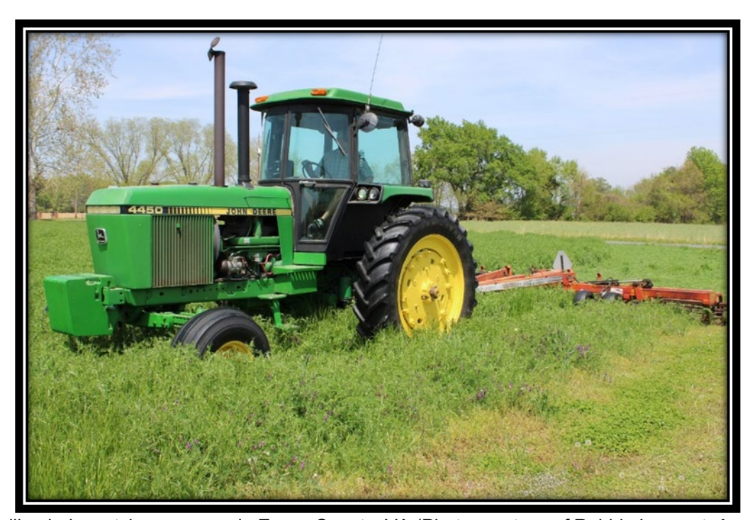
Figure 5. Rolling hairy vetch cover crop in Essex County, VA

Good stands of hairy vetch were achieved at the Essex County sites and were rolled using a rolling harrow which had not been used for over 20 years (see picture below.) The tool did a great job and was utilized to facilitate easier corn planting into a living cover crop, often referred to as planting green. All sites were planted green prior to cover crop termination in late April at approximately 29,500 seeds per acre. Termination of the cover crop was completed with a burndown herbicide mix that included glyphosate and 2, 4-D.