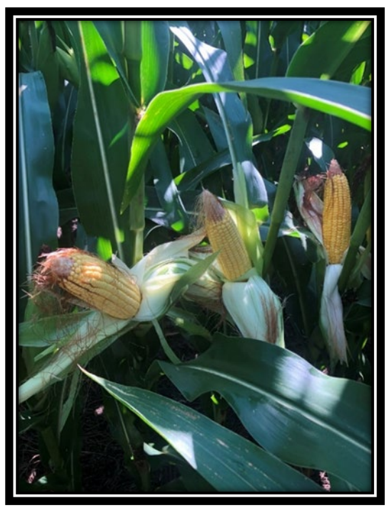
Figure 6. Corn with 45 lbs. of nitrogen per acre at planting only following hairy vetch cover crop

Yields from the four sites in Essex County were excellent and were determined using a calibrated combine yield monitor. See the table 31.