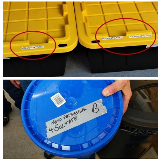
Figure 5. Labeled secondary containers with nutrient concentrated nutrients (top) and nutrient solutions (bottom).

Product labels and safety data sheets (SDS) for all chemical materials should be readily available. Training and procedures for the proper handling, mixing, applying, storing, and disposing of agricultural chemicals (nutrients, acids, plant protection products) should be developed to prevent accidents and contamination of produce. Secondary and bulk containers with concentrated chemicals, and nutrient mixes and acids, feeding into the water delivery system, should be well labeled to indicate the contents of the containers (Figure 5) (Vallotton et al. 2022a, 8-9).