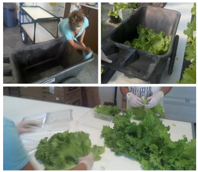
Figure 7. Dedicated wheelbarrow used for harvesting (top left and right), along with lettuce being sorted and packed into clamshells (bottom). (Amber Vallotton, Virginia Cooperative Extension)

harvested crop is packed directly into containers and boxes in the production area, a traceability code should be affixed to each unit of product. If harvested crop is re-packed in a place other than the production area, it is important to keep track of the growing location of the crop in the greenhouse prior to adding the traceability code in the packing area. See Vallotton et al. 2022b-c for more information about traceability.