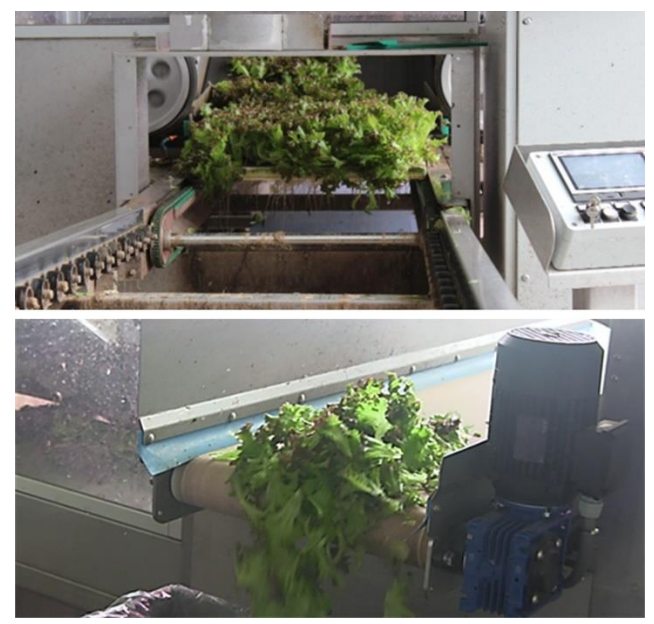
Figure 8. Automated harvesting machine cutting lettuce from DWC rafts (top and bottom).