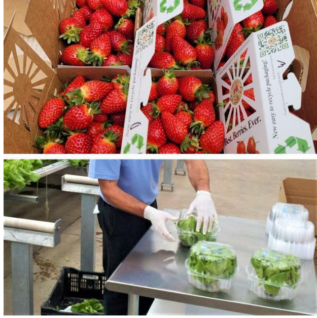
Figure 6. Strawberries being directly hand-harvested into specialized cardboard containers (top), and NFTgrown lettuce harvested directly into clamshells. (Amber Vallotton, Virginia Cooperative Extension)

If product is harvested by hand or with tools into a container or larger bulk bin, e.g., plastic wheel barrel, to be re-packed, these containers and bins should never be used for other purposes like storing new substrate or waste media and culls. It is always a good idea to have dedicated tools and containers that get used for specific tasks and are labeled accordingly. Examples of this would be NFT-grown lettuce harvested into a plastic bin and lettuce harvested from a vertical stack system into a large plastic wheelbarrow (Figure 7).