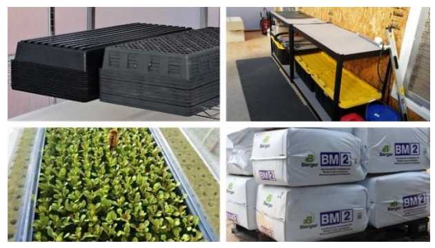
Figure 3. Cleaned and sanitized seed trays stored upside down on a metal shelf unit (top left); seed starting area with easy to clean tables (top right); seedling tray after seeds have germinated (bottom left); and bags of substrate stacked on pallets in seeding area (bottom right).

germination and/or media systems, should have paperwork to document how the product has been manufactured and handled to ensure the materials are free of plant and animal pathogens and heavy metals (CEA Food Safety Coalition 2021, 10-11). Animalbased amendments should not be used or stored in the facility. Substrate materials should be stored, protected, and handled in such a way as to prevent contamination.