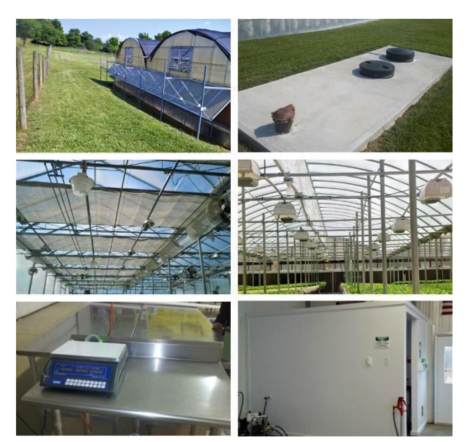
Figure 2. Site and infrastructure characteristics to consider, including site layout and adjacent land use (top left); well water system (top right); structural framing, supports, and lighting (middle images); packing areas (bottom left); and restroom facilities (bottom right).

When considering the site, it is important to understand the site topography, water sources, drainage, sewage system, and all fixed infrastructure such as buildings and roads, and adjacent land use (Bardslev et al. 2022c: CEA Food Safety Coalition 2021) (Figure 2). This includes the actual greenhouse structure (glass, plastic, framing supports, lighting, ventilation, heating, cooling, and sensors), the greenhouse system (benches, ponds, towers, permanent irrigation and fertigation systems, pumps, and robotics), the headhouse space, packing and storage areas, office areas, restrooms, and doors. It also includes the condition of materials used for walls, ceilings, floors, and drains, especially for repurposed and retrofitted CEA facilities. Site plans, blueprints, greenhouse system specifications, and other records can provide information to help with assessing the risks.