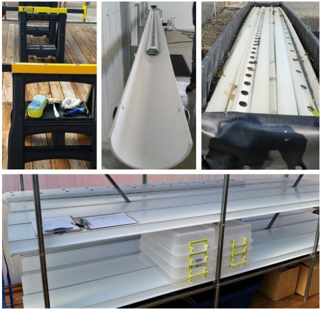
Figure 4. Methods for cleaning and sanitizing NFT channels: plastic sawhorses (top left); a large PVC pipe cut in half for placing channels sprayed with a pressure washer (top middle); a plastic-lined trough for soaking dirty channels (top right); and sanitized channels stored on a large shelving unit (bottom).

When using a nutrient film technique (NFT) system or a media system, you should have procedures in place for regularly cleaning and sanitizing growing channels (gutters), plastic Dutch buckets, bulk growing containers, or vertical stack containers. Cleaning and sanitizing should be conducted between each rotation. Growing channels and containers that have been cleaned and sanitized should be stored properly between uses (Figure 4). Plastic bags should not be re-used since they cannot be easily cleaned and sanitized.