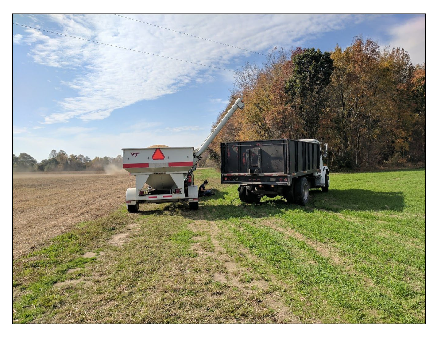
MATURITY GROUP 5 VARIETY COMPARISONS