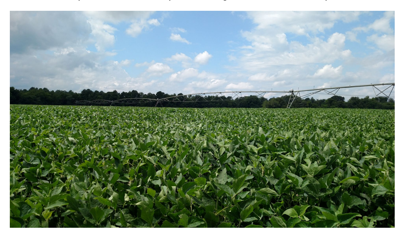
Center pivot irrigation at the Cloverfield location.