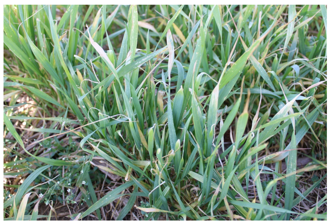
Figure 2 : Freeze injury continues to be a concern for small grain producers, pictured here on March 23, 2022 in Essex County.