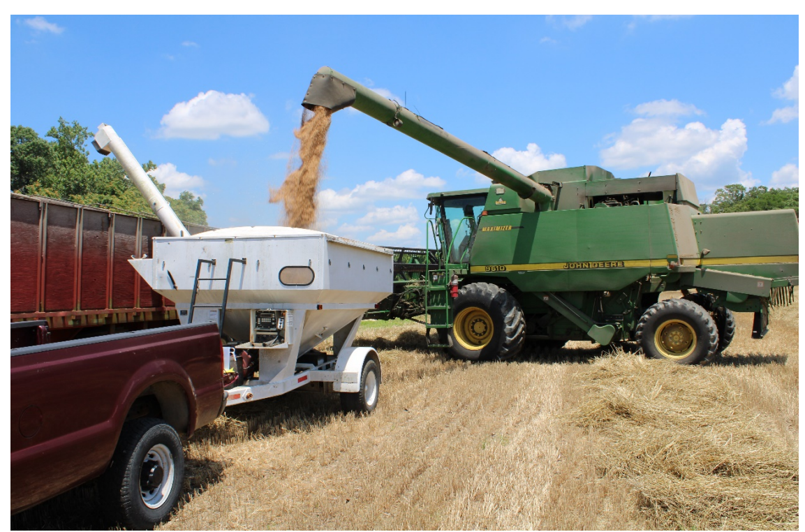
Figure 1 : Harvest of the King William County On-Farm Wheat Variety Plot. The grain is harvested by the combine and run onto the weigh-wagon to determine grain weight for yield, and then transferred to the producer's trailer.