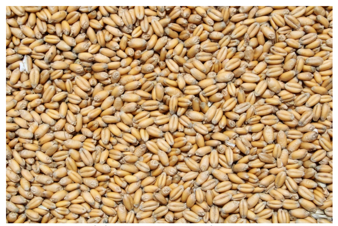
Figure 3: Soft red winter wheat grain following harvest