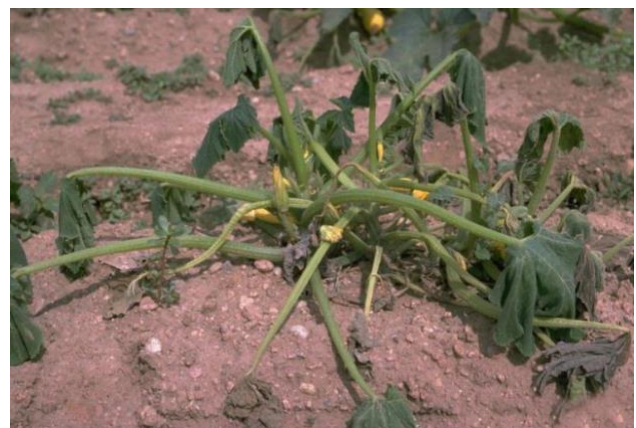
Figure 4. Wilted foliage and water soaked leaves are symptoms of Phytophthora crown rot.

This multi-symptom pumpkin disease is caused by the oomycete Phytophthora capsici . Seedling damping-off, leaf spots, foliar blight, root and crown rot, stem lesions, and fruit rot are among the potential issues. Leaf spots can be dark brown and large. If crowns are infected, the plant can die in a very short period of time. When the vine is affected, the tissue becomes brown, appears water soaked, and often collapses (figure 4) (McGrath, 2018).