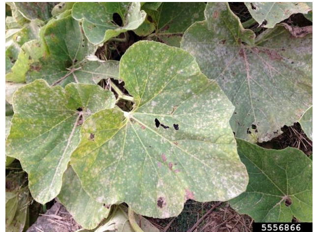
Figure 1. Cucurbit powdery mildew symptoms and signs.

plant from powdery mildew can lead to more diseases (McGrath, 2017).