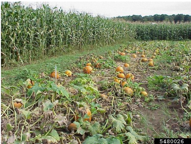
Figure 3. Downy mildew can devastate a pumpkin crop.

The spores can be wind-borne and can survive over long distances if the air is moist. They are also easily spread to other plants by splashing water. Downy mildew is usually considered a cool, wet weather disease; however, it can also be spread and infect plants over a 50°F to 80°F degree range. The optimum temperature range for sporulation 61°F to 72°F. If there is heavy dew in the morning, that can be enough for infection to occur. High relative humidity, overhead irrigation, or persistent rain can provide ideal conditions and result in severe damage (figure 3). The pathogen needs a host to survive and it can only overwinter on plants in sites with warm weather, such as the southern US and greenhouses (Quesada-Ocampo, 2019).