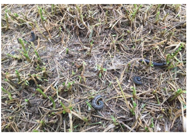
Figure 3. When present in large numbers, fall armyworms can defoliate lawns, especially coolseason lawns like this one grassed with tall fescue.

be remediated with standard recommended fall fertility programs. However, if the damage is extreme (as seen in Figure 3) and recovery potential is limited, fall renovation or reseeding might be required. There are no turfgrass cultivars that are 'resistant' to fall armyworm damage, but renovation will afford you the opportunity to reseed with superior turfgrass varieties that you will find on the Virginia Turfgrass Variety Recommendation List from the VCE publication resources website (https://resources.ext.vt.edu/).