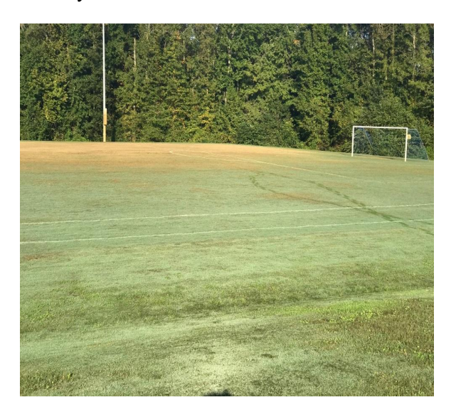
Figure 2. The brown bermudagrass turf on this sports field has been damaged by fall armyworms feeding on the leaves.

they move. Hence, the common name that suggests an army is on the move.