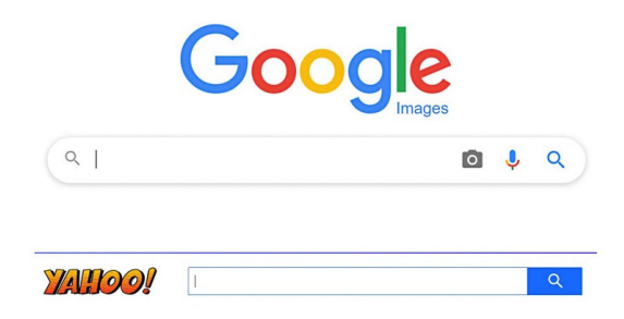
Figure 1. Examples of search engine boxes.

Computers and mobile devices also use different search engines to find information on the internet. Search engines usually display an empty box, inside which you can type key terms. The box often has a magnifying glass symbol beside it (fig. 1).