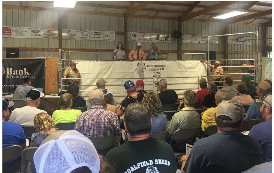
A crowd of producers from eight states pays close attention to the auctioneer at the Second Annual Hair Sheep Sale in 2023.