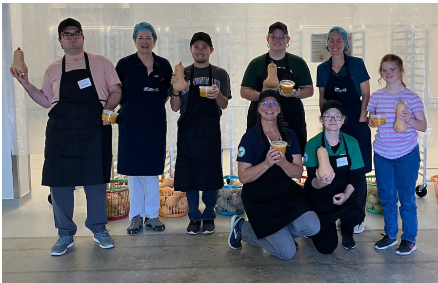
Stone Soup job training program participants prepare butternut squash soup to donate to local food banks.