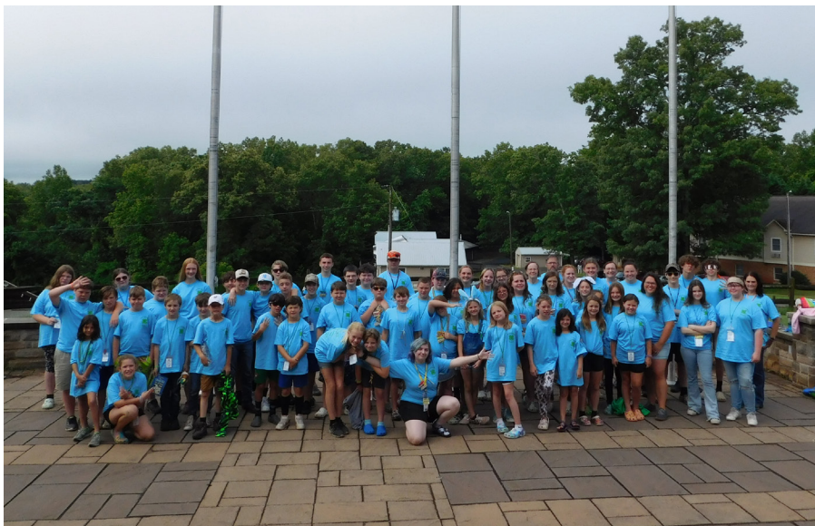
2023 Craig County 4-H Camp.