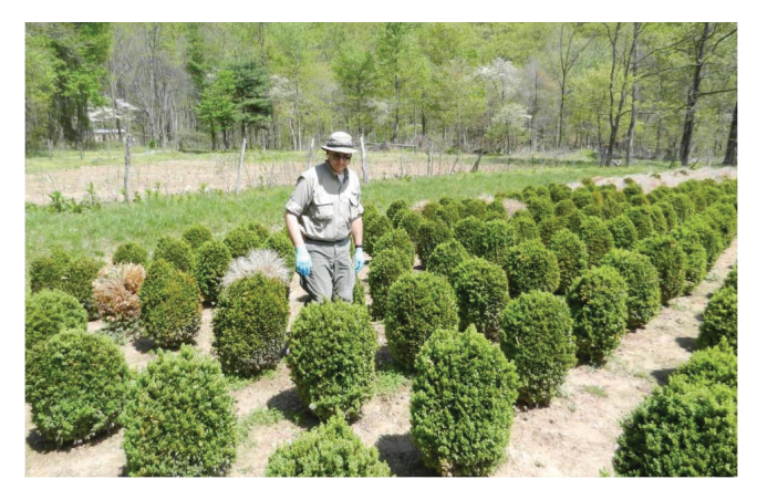
Figure 8. Scout host plants frequently.