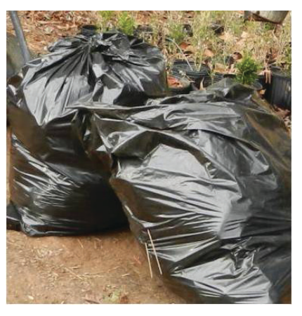
Figure 1. Infected plants should be bagged to contain leaf debris.