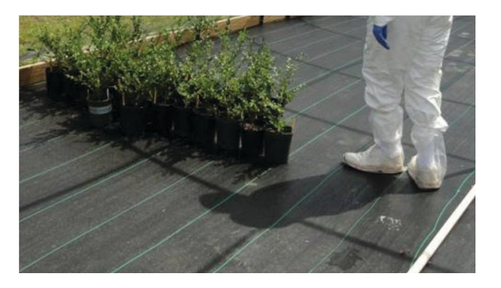
Figure 5. Store plants on easy-to-clean surface such as weed mat over well drained gravel.