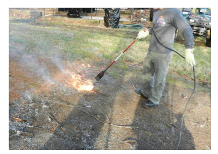
Figure 2. Residual leaf debris can be eradicated by burning with an agricultural flamer.

was detected. Move boxwood production to a new area of nursery and preferably over concrete, asphalt, or weed mat over gravel.