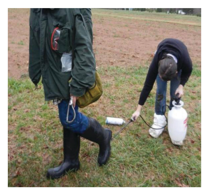
Figure 6. Clean and sanitize boots between hoop houses and productions fields.