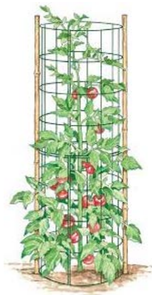
Figure 5. Caging tomato plants.

Caging is used for heavier crops, including melons and summer/winter squashes that may overburden a trellis or stake due to weight of produce. Caging is also a common approach for supporting the long vines of indeterminate tomatoes. Cages can be easily fashioned by rolling a rectangular section of metal livestock fencing or chicken wire into a cylindrical form, though any shape will do (Figure 5). Four-inch mesh spacing is wide enough to reach through for hand harvesting. If your material is smaller than that, cut larger access holes intermittently around the cage. Fasten the cage to one or two stakes driven into the ground for added stability. The size of cages varies depending on plant spacing and type of crop. Melons and squash hanging from plants growing in cages may need extra support. Slings can be made from reused materials like old t-shirts and mesh bags and attached to cages to cradle heavy fruit.