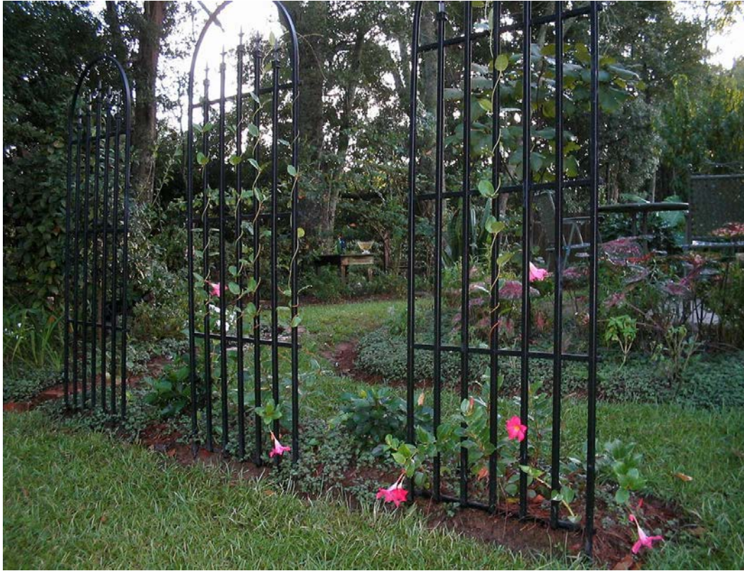
Figure 2: Example of trellising. Wikipedia Trellis (architecture) Article .