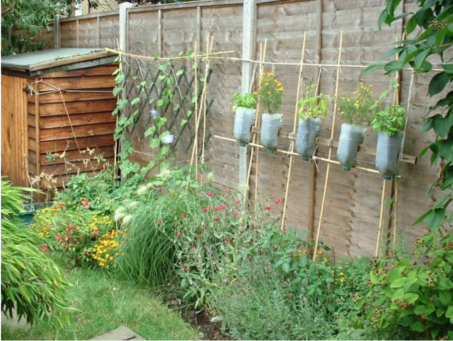
Figure 1: A diversity of materials used in vertical gardening.