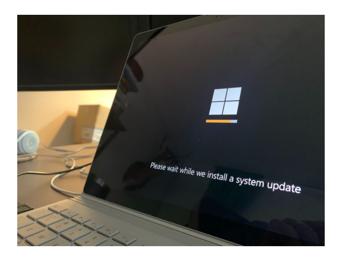
Figure 4. Keeping software, applications, and devices such as laptops and cellphones up to date is an important piece of cyberbiosecurity practices (Carneiro et al., 2021).