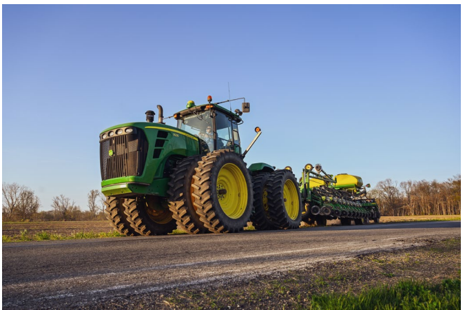
Figure 2. Technology and advanced equipment used in the food and agricultural industries contribute to efficiency but can bring risk of cyber-attack.

Automation and technology causing vulnerabilities can include: