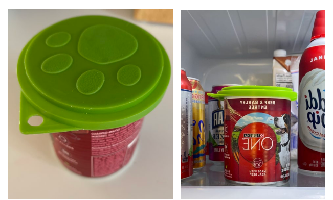
Figure 3. Examples of the correct storage of canned moist pet food being tightly covered and held at proper temperatures. Photos courtesy of Laura K. Strawn. Authors are not endorsing any product or brand.