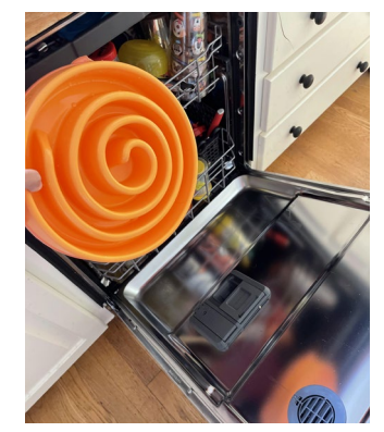
Figure 2. Proper washing of pet food bowl. Authors are not endorsing any product or brand.

Ensuring the proper storage of pet food can assist in maintaining its safety and maintain the products' nutritional value. Here are some best practices for storing pet food: