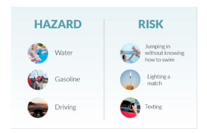
Figure 2. To illustrate the difference between hazards and risks, consider water, gasoline and driving. They are all examples of everyday substances/activities that are hazards based on their potential to cause harm. The potential of harm associated with each of these hazards is elevated when coupled with risky actions such as jumping into water without knowing how to swim, lighting a match near gasoline or texting while driving. Image developed by: Campaign for Accuracy in Public Health Research

(https://campaignforaccuracyinpublichealthresearc h.com/risk-vs-hazard/).