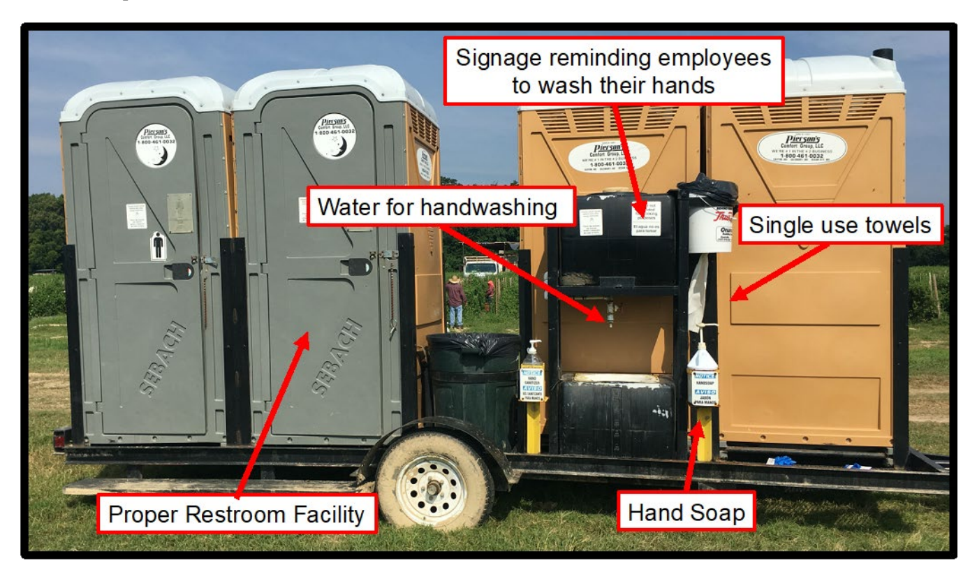
Figure 3. Clean restroom facilities, water for handwashing, hand soap, and single use towels must be available for employees and located near working areas that are easily accessible.

from fields and storage areas). Toilet and handwashing stations must be supplied with single use towels, hand soap, toilet paper, potable water for handwashing, and a catch basin for greywater (Figure 3). The presence and availability of these materials should be monitored and well stocked. All toilet and handwashing stations must be serviced and cleaned on a scheduled basis, which is based on size of farm and/or number of employees and frequency of visitors. Records on the maintenance, cleaning, stocking, etc., of toilet and handwashing stations should be kept.