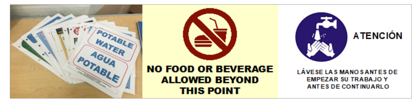
Figure 2. Effective signage will remind and inform employees and visitors of food safety practices on the farm. Signs should be easily understood and placed in locations that are easily visible.

Required signage (e.g., rules for visitors, bathroom and handwashing stations, designated break areas, drinking water vessels, chemical storage, first aid kit locations, traceability system coding, areas that are off limits, etc.,) should be posted to instruct or remind employees and any visitors of the farm's food safety practices or show them where important items or facilities are located (Figure 2). When developing employee signage, signage should be easily understandable in a language all employees can understand and should use pictures or graphics for those who may not be able to read. Signage should always be posted in a visible location in which other materials aren't distracting.