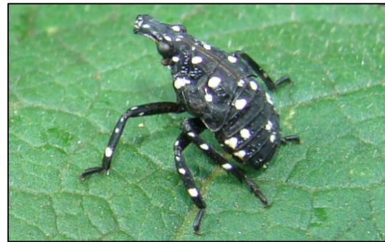
Figure 3. Young spotted lanternfly nymph (E. Day, Virginia Tech).

and legs (Fig. 3). Mature nymphs (up to 16 mm or 0.6") are red and black with white spots (Fig. 4). Nymphs are wingless and can jump but not fly.