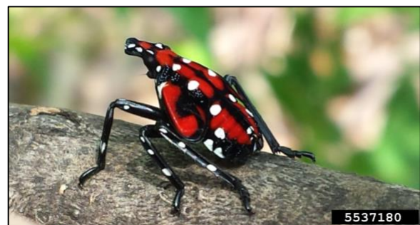
Figure 4. Mature spotted lanternfly nymph.

SLF egg masses are approximately 25-38 mm (1-1.5") long and 13-19 mm (0.5-0.75") wide. They are usually covered with a shiny grey, waxy protective covering when fresh. In time the covering turns a dull grayish-brown and may crack and fall off, exposing the eggs underneath (Fig. 5).