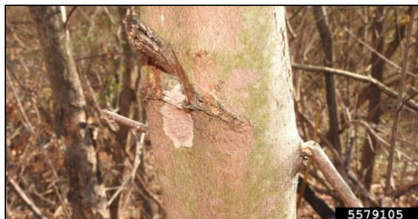
Figure 5. Spotted lanternfly egg mass (Richard Gardner, Bugwood.org).

be found on vehicles, mobile homes, lawn furniture, grills, dog houses, and decorative yard items. They can also be found on fencing, tarps, decking, construction materials, and firewood. Do not move any items that may have egg masses on them as the eggs can hatch in the new location.