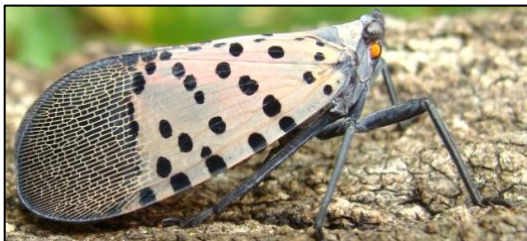
Figure 1. Adult spotted lanternfly.

Adult SLF measure about 2.54 cm (1") long and 1.3 cm (0.5") wide. The forewings are light colored with black spots and rectangles (Fig. 1). The hindwings are red, black, and white (Fig. 2). At rest, the forewings covering the colorful hindwings (Fig. 1).