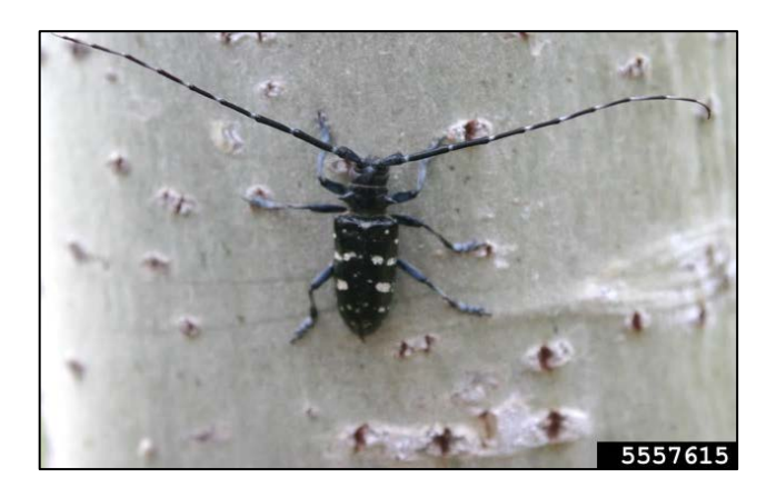
Figure 1. Adult Asian longhorned beetle.

The invasive Asian longhorned beetle (ALB, Anoplophora glabripennis ) is a large beetle with long antennae (Fig. 1). Adults measure roughly 2-4 cm (0.75-1.5") long. The antennae are about the length of the female's body, but twice as long in males. They have numerous white spots of different sizes on the shiny black wing covers. The long antennae have distinctive black and white bands. The legs, feet, and underside of the body may appear bluish (Fig. 2).