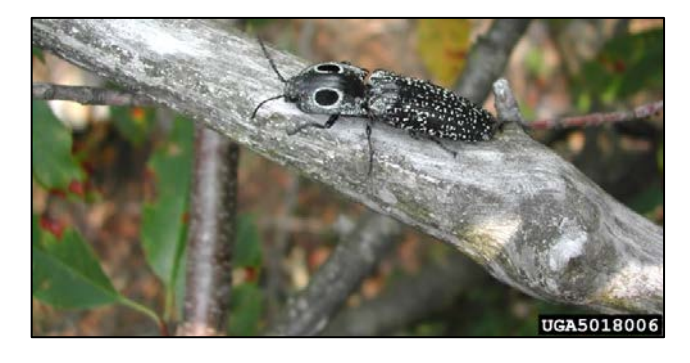
Figure 5. Eyed click beetle (PA Dept. of Conservation & Natural Resources, Bugwood.org).

The eyed click beetle ( Alaus oculatus ) is a native species that superficially resembles ALB (Fig. 5). It averages 2-4.5 cm (0.8-1.8") in length. It has a shiny black body with two very large black spots ringed in white behind the head. The wing covers are noticeably grooved and densely covered with irregular white patches. Unlike longhorned beetles, the antennae are relatively short and the body is flattened.