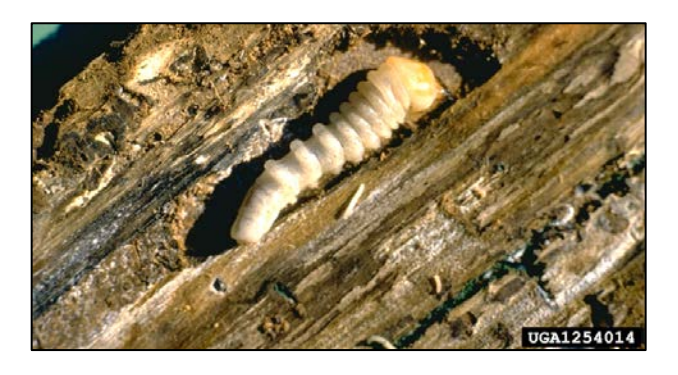
Figure 6. Typical longhorned beetle larva in gallery (William M. Ciesla, Forest Health Management International, Bugwood.org).

Adult ALB leave infested wood through exit holes large enough to insert a pencil (Fig. 7). Large beetle larvae found in live hardwoods, particularly maple trees, with large exit holes should be suspect for ALB. Large beetle larvae found in conifers are likely pine sawyer larvae and not suspect ALB.