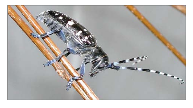
Figure 2. Adult longhorned beetle.

Longhorned beetles, including ALB, belong to the Family Cerambycidae in the Order Coleoptera. There are many species of longhorned beetles in Virginia. The whitespotted sawyer (Monochamus scutellatus) is the species mostly likely to be confused with ALB. It has a bronzy-black body with white markings and long antennae. However, the body is not as shiny, the bands on the antennae are not as conspicuous, and the white markings are mottled and not well-defined. In addition, there is a prominent white semicircle patch centered at the top of the wing covers and directly behind the beetle's "neck" (Fig. 3). In comparison, this area is dark on ALB. Whitespotted sawyers are harmless native beetles that feed in stressed, dying, and dead conifers.