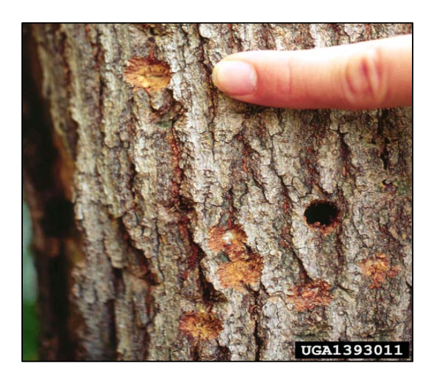
Figure 7. Exit hole (indicted by red arrow) produced by emerging adult Asian longhorned beetles and shallow tan sites where eggs are laid.