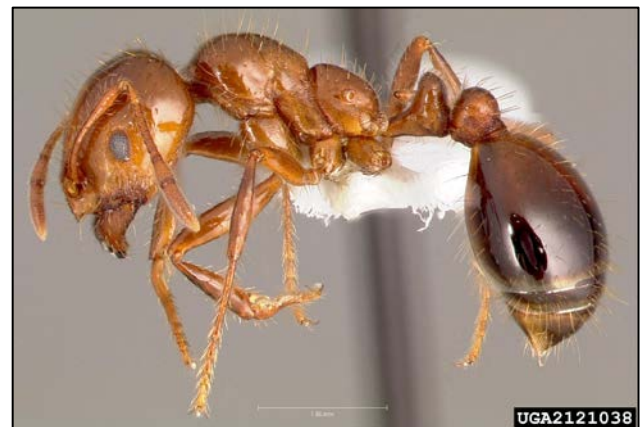
Figure 2. Fire ant worker (April Noble, Antweb.org, Bugwood.org).

Adult imported fire ants have a two-node “waist” and antennae with 10 segments, including a two-segmented club at the tip (Fig. 2). Solenopsis invicta is a reddish brown but its hybrids may be darker in color. The stinger visibly protrudes at the tip of the abdomen. Other ants in Virginia are also known to build mounds and/or sting and may be mistaken for imported fire ants. Contact your local Cooperative Extension office to have ants identified as the appropriate management strategy may differ by the species of ant present. Ants other than imported fire ants are not under quarantine in Virginia.