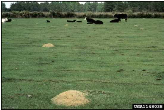
Figure 3. Fire ant mounds in a cattle pasture.

animals intended for consumption. Some products labelled for use against fire ants in pastures can be used for companion animals such as horses or llamas, but not with animals intended for meat or milk. Some products are labeled for both broadcast application as well as a mound treatment, but different rates are used for the different application methods. See Table 1 for materials labeled for use in pasture and rangeland in Virginia with applicable grazing and haying restrictions.