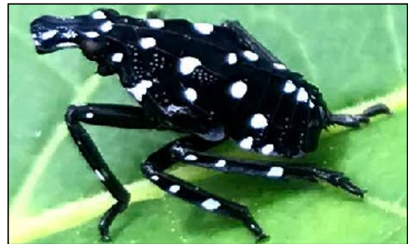
Figure 3. Young spotted lanternfly nymph (Eric Day, Virginia Tech).

the white spots and are also wingless (Figs. 4 & 5). They measure up to 16 mm (0.6") long.