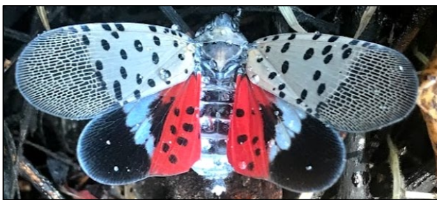
Figure 2. Adult spotted lanternfly.