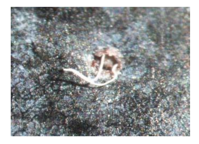
Figure 4. Respiratory filaments on a spotted-wing drosophila egg projecting from an oviposition puncture in a blueberry.

Biological Control: Because of the ability of SWD to encapsulate and kill the eggs of our native parasitoid wasps, biological control has not been successful. Research is underway to find parasitic species that are able to attack this species.