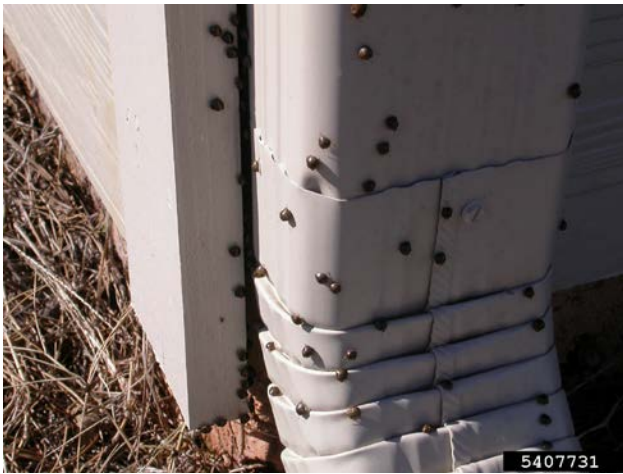
Figure 6. Adult kudzu bugs on the exterior of a white home.