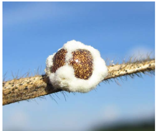
Figure 8. A kudzu bug adult infected by the fungal agent, Beauveria bassiana

Beauveria bassiana (Figure 8) is a soil-dwelling fungus that, when present, can provide high levels of kudzu bug control. This fungus has been positively identified on kudzu bug in Virginia and rapidly spreads between bugs as they aggregate to overwinter.