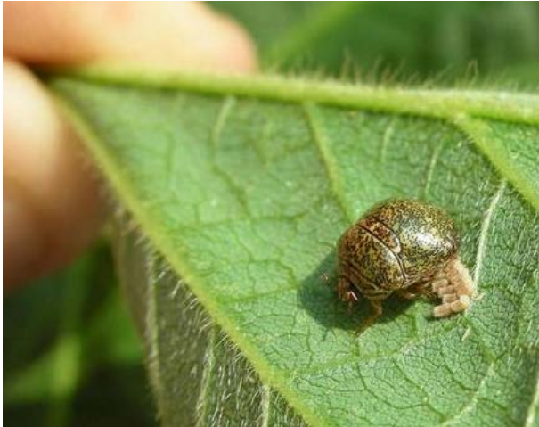
Figure 1. Adult kudzu bug on soybean leaf.