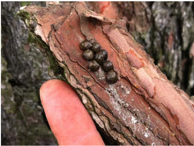
Figure 3. Kudzu bug adults overwintering under tree bark.

surviving overwintering females can lay these already fertilized eggs to start the first generation of kudzu bugs, or unmated females will find and mate with males and then lay eggs. Eggs are white, barrel-shaped in appearance, and are laid in two side-by-side rows (Figure 4). Eggs are usually laid on the undersides of plant leaves (kudzu or soybean) or on apical tips of kudzu vines. After emerging from eggs, neonate kudzu bugs will remain close to eggshells (Figure 4). When a female kudzu bug lays her eggs, she also deposits a packet of gut endosymbionts with each egg. Neonates must consume this endosymbiont to survive; without it, they will not be able to grow and develop normally.