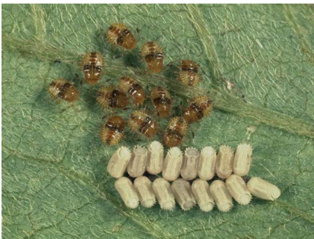
Figure 4. Neonate kudzu bugs surrounding hatched eggs with endosymbiont packets attached.

surviving overwintering females can lay these already fertilized eggs to start the first generation of kudzu bugs, or unmated females will find and mate with males and then lay eggs. Eggs are white, barrel-shaped in appearance, and are laid in two side-by-side rows (Figure 4). Eggs are usually laid on the undersides of plant leaves (kudzu or soybean) or on apical tips of kudzu vines. After emerging from eggs, neonate kudzu bugs will remain close to eggshells (Figure 4). When a female kudzu bug lays her eggs, she also deposits a packet of gut endosymbionts with each egg. Neonates must consume this endosymbiont to survive; without it, they will not be able to grow and develop normally.