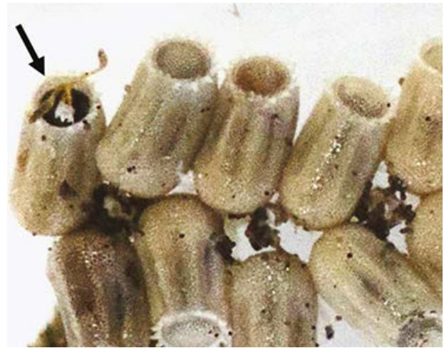
Figure 7. Egg parasitoid Paratelenomus saccharalis (black arrow) emerging from a kudzu bug egg (Photo: modified from Ademokoya et al. 2018).

At least two species of extremely small wasps, Paratelenomus saccharalis and Ooencyrtus nezarae , parasitize kudzu bug eggs (Figure 7) and considerably reduce pest populations in the field. Naturalized populations of these parasitoids have been found in southern US states, including VA, and kudzu bug management is aided by the wasps in these locations.