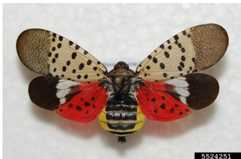
Spotted lanternfly, wings extended