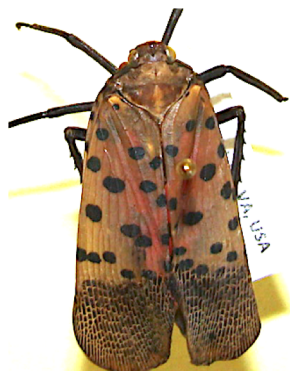
Spotted Lanternfly Eric Day, Virginia Tech

The adult spotted lanternfly, Lycorma delicatula (White), has a very distinctive appearance with black spots and bars on the upper wings and red, black, and white on the hindwings. Adults measure about 1" long and 0.5" wide. A few other insects in Virginia have similar color patterns, but a close look will show that spotted lanternfly is easily recognizable. Sizes not to scale. Upper left photo: Eric Day. All others: Bugwood.org