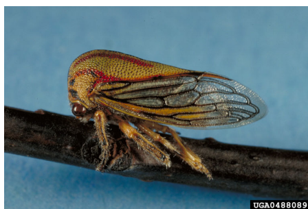
Oak treehopper