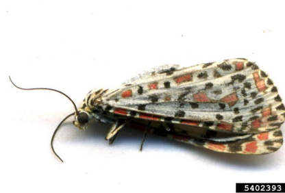
Ornate bella moth