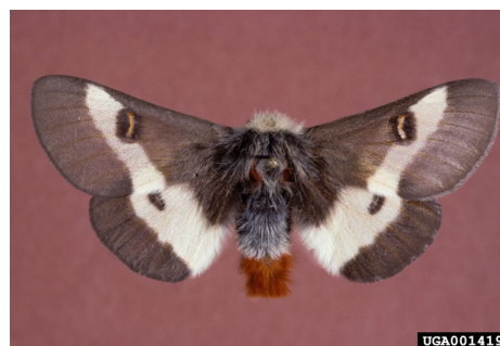
Buck moth