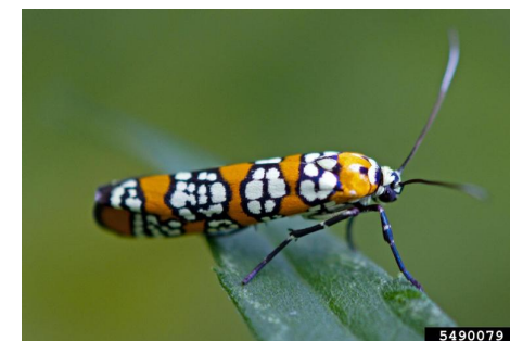
Ailanthus webworm