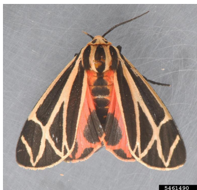
Tiger moth