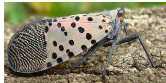
Adult Size- about 1 inch (25 mm) long