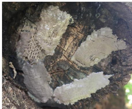
Multiple egg masses Size- about 1.5 inch (33 mm) long

The Spotted Lanternfly (SLF) overwinters in an egg mass (diagonal lines) that begins shiny gray but quickly turns to a dull brownish gray. The eggs hatch late April to early May and the nymphs (red bars) are present until late July when they become adults (yellow bars). Adults start to lay eggs in September. The life stages can overlap and, depending on the time of year, multiple stages can be found at the same time.