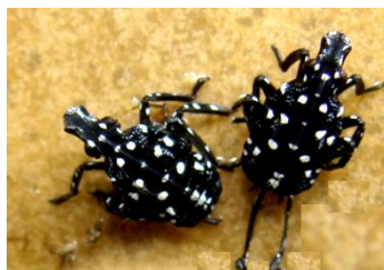
Young nymphs Size- up to 3/8 inch (4 mm) long.