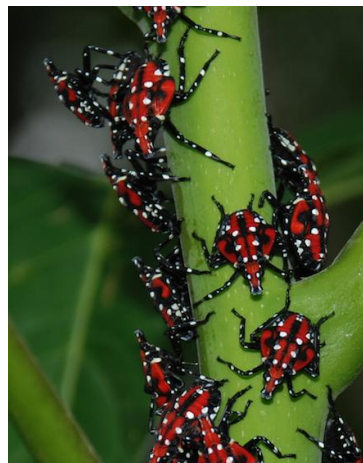
Mature nymphs Size- 7/8 inch (12 mm) long