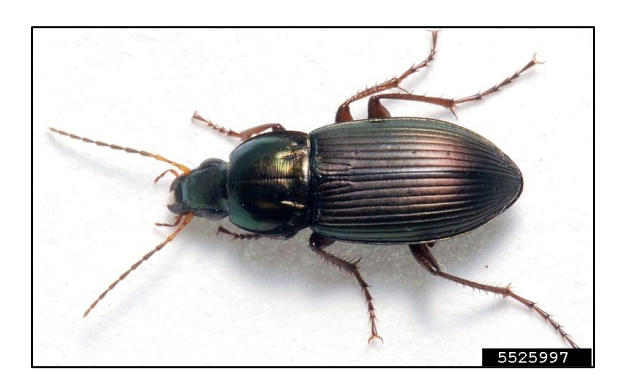
Figure 1. Typical appearance of a ground beetle.

Ground beetles, also called carabid beetles, are common insects found throughout Virginia. Many are a drab brown or black (Fig. 1), but others are brightly colored or even have an iridescent or metallic appearance (Fig. 2). Most species are primarily carnivorous, eating caterpillars, maggots, grubs, and other soft-bodied insects. Some prey on snails and worms. A few species feed on plants, including weed seeds and young seedlings. Two species (Stenolophus lecontei and Clivinia impressifrons) can be plant pests, attacking corn or sovbean seeds as they germinate and reducing the plant density of these field crops. However, most species of ground beetles are considered beneficial insects in the environment. Ground beetles belong to the Family Carabidae in the Order Coleoptera.