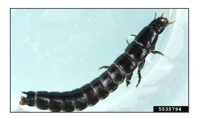
Figure 3. Yellowing and stippling feeding damage by lace bugs on sycamore.