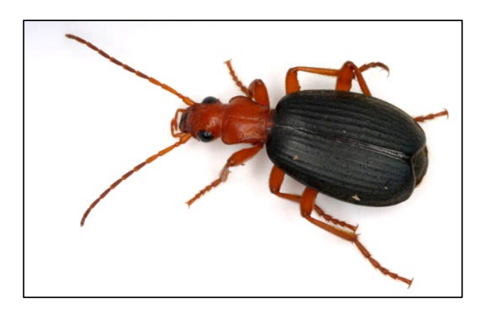
Figure 4. A bombardier beetle.

Bombardier beetles in the genus Brachinus are ground beetles with specialized defensive glands. These beetles can spray hot, noxious chemicals from the tip of the abdomen as a defense against larger predators. Some bombardier beetles in Africa can even direct the direction of the spray using the tip of their abdomen.