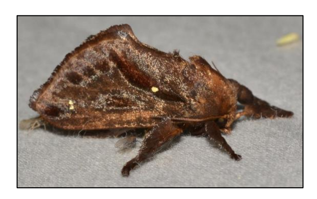
Figure 6. Adult saddleback moth.

Spiny Oak Slug (Euclea delphinii Boisduval) This caterpillar varies in color from greenish-yellow to brown to pink, usually with a darker central stripe down the back and sometimes with other patches of contrasting color (Fig. 7). There are three pairs of fleshy tubercules with poison spines at the head and two pairs towards the tip of the abdomen. Additional smaller tubercules, all bearing poison spines, run in two rows down the back and along the lower sides. Larvae feed on a wide host range, including oak, fruit trees, hickory, maple, sycamore, and many