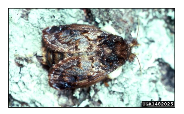
Figure 4. Adult hag moth.

Monkey Slug or Hag Moth (Phobetron pithecium) This larva is a truly bizarre caterpillar, densely furred with gray to brown hairs and numerous paired appendages projecting along the sides of the body (Fig. 1). Some of the "arms" are longer than the others and are often mistaken for the caterpillar's real legs. These appendages are often curled or twisted and they break off easily without apparent harm to the caterpillar. Some larvae may have stunted or missing "arms." This strange appearance may be mimicry of a large hairy spider to scare off potential predators, especially during the pupal stage, which is spent under the cast skin of the caterpillar. Monkey slug caterpillars feed on a wide range of host trees and shrubs, including fruit trees, rose, dogwood, oak, hickory, birch, and willow. Mature larvae measure about 2.5 cm (1") long. The appearance of the adult hag moth varies by sex. Female moths have gray patches on the wings interrupted with many heavily scaled dark brown lines (Fig. 4), while males have transparent patches on the wings. Both sexes measure 10-15 mm (about 0.5") long and have stout, dark, hairy bodies with fat tufts of lighter-colored scales on the legs.