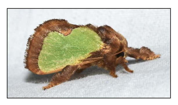
Figure 8. Adult spiny oak slug.