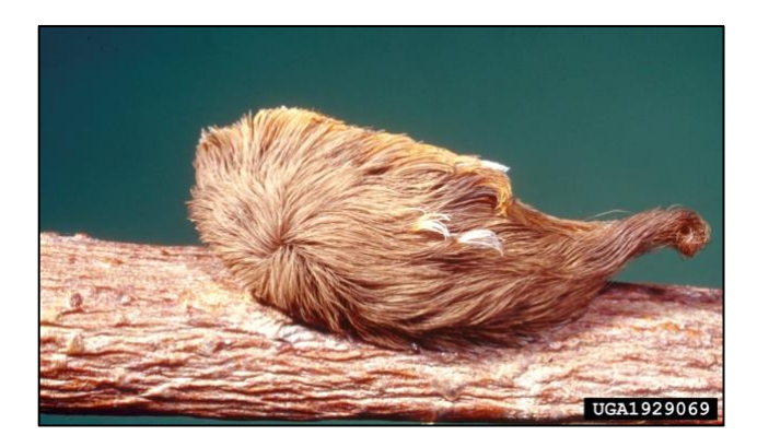
Figure 9. Puss caterpillar.

(Megalopyge opercularis) The larva of this species is entirely covered by a thick carpet of long grayishtan to dark brown hairs with a rusty stripe down the center of the back (Fig. 9). Younger larvae have a thick tuft of hairs extending beyond the tip of the abdomen like a tail. Overall, the caterpillar resembles a tiny mouse about 2.5 cm (1") long. The hairs on older larvae are sparser, unkempt, and do not conceal the stinging spines as well. Larvae feed on fruit and nut trees, oak, birch, and rose.