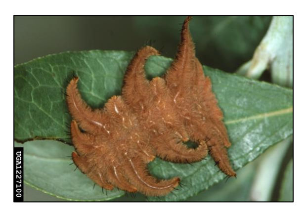
Figure 1. Monkey slug caterpillar

Slug caterpillars in the family Limacodidae move with a slow gliding motion like a slug. Some slug caterpillars are brightly colored with bumps, protuberances, or appendages (Fig. 1). Most have irritating hairs or spines capable of delivering a painful sting.