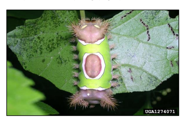
Figure 5. Saddleback caterpillar.

oval "saddle" centered on the green (Fig. 5). Both the green rectangle and the saddle are outlined in white and brown. There is a pair of large, fleshy tubercules at the anterior and posterior ends. There are additional pairs of smaller tubercules below the large pairs and along the lower sides of the larva as well. All of the tubercules possess formidable stinging spines. Mature larvae measure about 2 cm (0.8") long. Saddleback caterpillars are found on apple, maple, oak, corn, beans, and ornamental flowering plants. The stout adult moth is chocolate brown with light markings, measuring about 14-22 mm (about 0.6-0.9") long (Fig. 6).