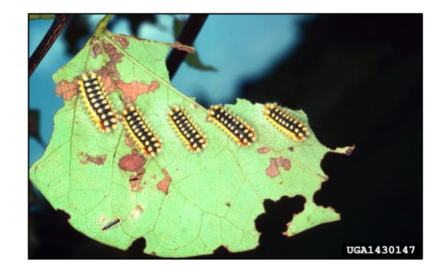
Figure 2. Hackberry leaf slug caterpillars.

Adults of both the Limacodidae and the Megalopygidae are stout, hairy moths that hold their wings in a tented position over their backs (Fig. 3). Limacodid moths also tend to hold the tip of the abdomen elevated over their backs. Adult moths of stinging caterpillars are not known to cause dermatitis and attract far less attention than the rather bizarre-looking larvae.