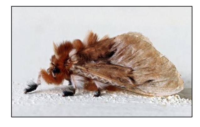
Figure 3. Adult southern flannel moth.