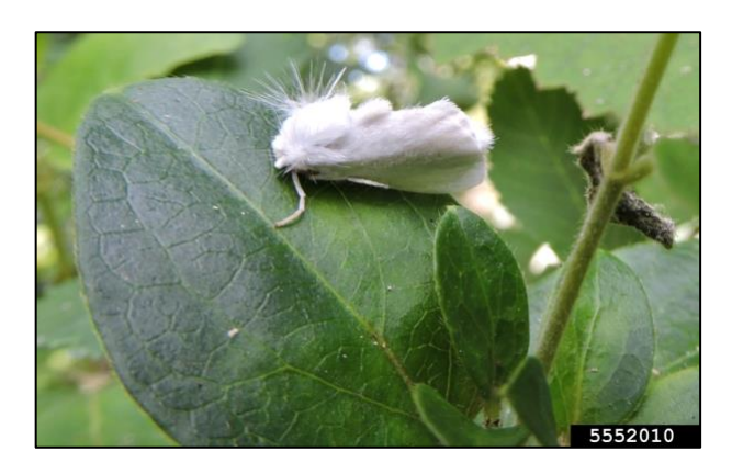
Figure 8. Adult white flannel moth (Royal Tyler, Pro Pest and Lawn Store, Bugwood.org).