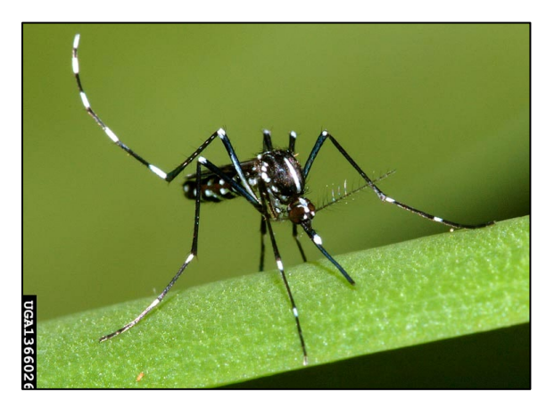
Figure 1. Asian tiger mosquito.

Mosquitoes (Fig. 1) occur throughout Virginia and are both nuisance pests and potential carriers of disease. Knowledge of their habits and basic control measures can reduce their threat and annoyance.