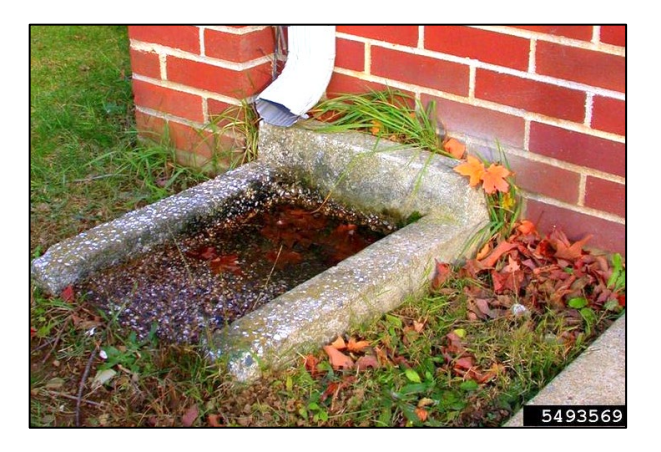
Figure 4. Standing water provides breeding sites for mosquitoes.

Mosquito larvae live in non-moving, still water often with some organic matter in it (Figs. 4 & 5). They like cans, buckets, gutters, water gardens, birdbaths, kiddie pools, tree holes, puddles, open rain barrels, flower pots, cemetery vases, animal water dishes, and sheets of plastic on the ground that hold water (Figs. 4). Shallow water is more attractive than deep water, and even small containers that hold only several ounces of water are prime breeding habitats for mosquitoes. Excess rain in the spring will provide plenty of breeding places for mosquitoes. Mosquitoes do not survive in water sources that support fish or beneficial aquatic life, which quickly eat the mosquito larvae. They are not found in streams, rivers, ponds or fast-moving water.