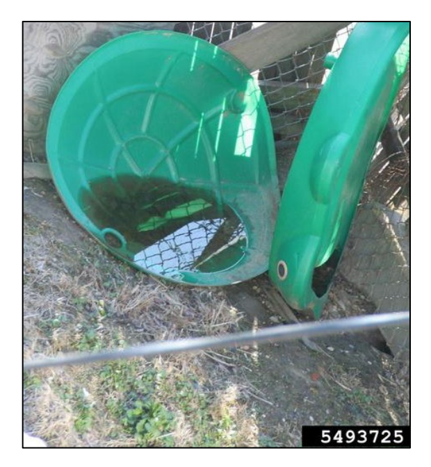
Figure 5. Children's outdoor play toys frequently collect water and should be emptied weekly.

Figure 4. Standing water provides breeding sites for mosquitoes.