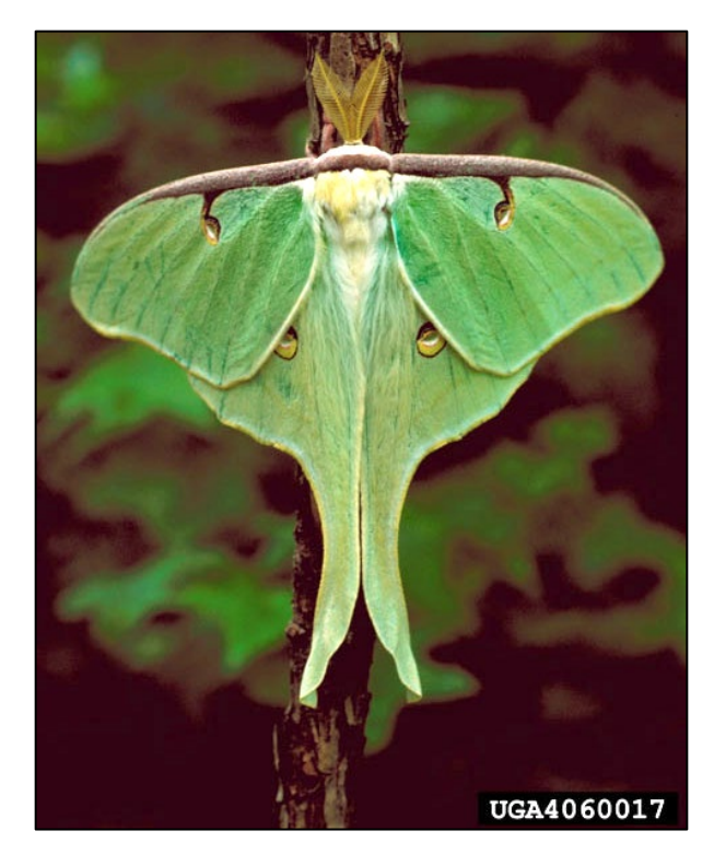
Figure 3. Adult luna moth.