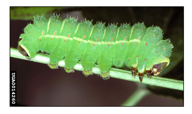
Figure 4. Luna moth caterpillar.