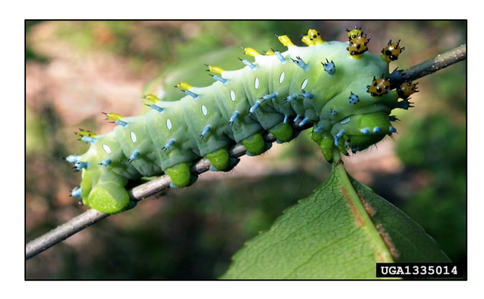
Figure 6. Cecropia moth caterpillar.