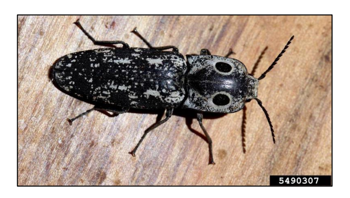
Figure 7. Eyed click beetle.