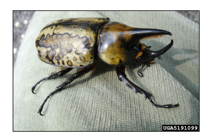
Figure 2. Male eastern hercules beetle.

measure over 4 cm (2 inches) long. The males have long projections on the head and thorax that are used to knock other males off trees but are otherwise harmless. The adult female is similar in size and color, but is hornless. The immature stage is a large white grub found inside oak and locust trees with heart-rot.