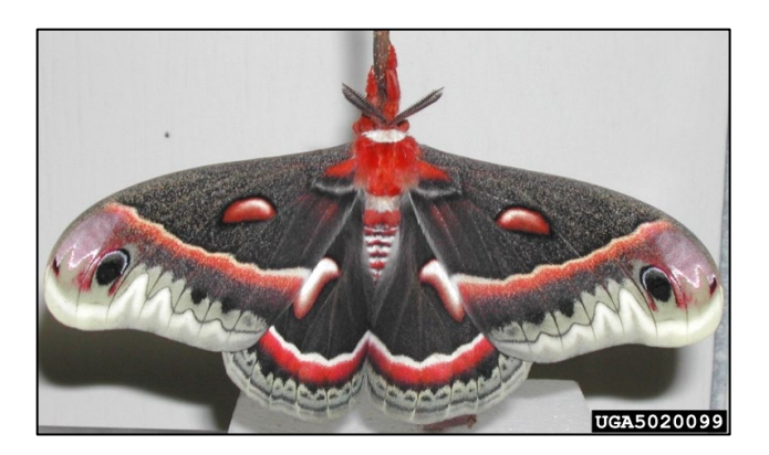
Figure 5. Adult cecropia moth (Pennsylvania Department of Conservation and Natural Resources – Forestry, Bugwood.org).

Cecropia moths, Hyalophora cecropia , are another large moth with a wingspan of up to 10 cm (4 inches) (Fig. 5). They are also attracted to porch lights, and are often found on screens and walls the next morning. The caterpillars feed on the leaves of various hardwood trees (Fig. 6).