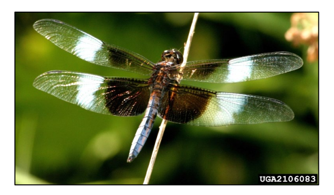
Figure 8. Adult dragonfly (David Cappaert, Bugwood.org).

Dragonflies can have a wingspan of 7-10 cm (3-4 inches) and are found mostly near water, but also in fields and woods (Fig. 8). Adults feed on insects they capture in flight. Males fight for the best sites near water, where the females will lay their eggs. The immature stages are aquatic. Dragonflies are also known in folklore as "snake doctors" due to the belief that they would help injured snakes.