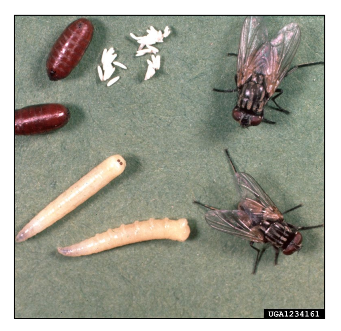
Figure 2. Life stages of the house fly. Beginning at the top are the white eggs, adults, larvae, and brown pupae. (Clemson University USDA Cooperative Extension Slide Series, Bugwood.org).

with a tapered head and no head capsule. The body is elongated and broadest at the end of the blunt, flattened abdomen. Maggots have bands of tiny, flat, teeth-like spines encircling the body to help them move through their food. Mature maggots measure about 10 mm (0.4 inch). Larvae grow and molt three times before pupating in dry areas surrounding their food source. Larval development progresses rapidly at warmer temperatures. Pupae resemble elongated oval capsules with a tough brown skin. Adult flies emerge to mate and lay eggs. Multiple generations occur each year, limited primarily by cold temperatures and the availability of suitable food sources. They overwinter as pupae.