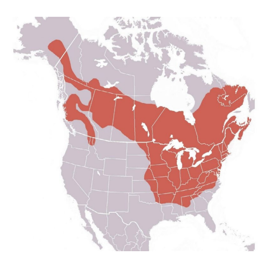
Figure 2. Geographic distribution of the woodchuck ( Marmota monax ) in North America (<u>Image</u> by Andreyostr online at https://commons.wikimedia.org/wiki/File:Marmota_monax_ range.png, licensed under the <u>GNU Free Documentation</u> <u>License</u>, https://commons.wikimedia.org/wiki/Commons:G-NU_Free_Documentation_License,_version_1.2.)

Woodchucks are found throughout the eastern and upper midwestern United States and much of southern Canada (figure 2), making them the most widespread member of the North American Marmota genus. They are found in every county in Virginia except for several in the far southeastern corner of the state (figure 3). Although multiple subspecies of the woodchuck exist across its range, the recognized subspecies here in Virginia is Marmota monax monax .