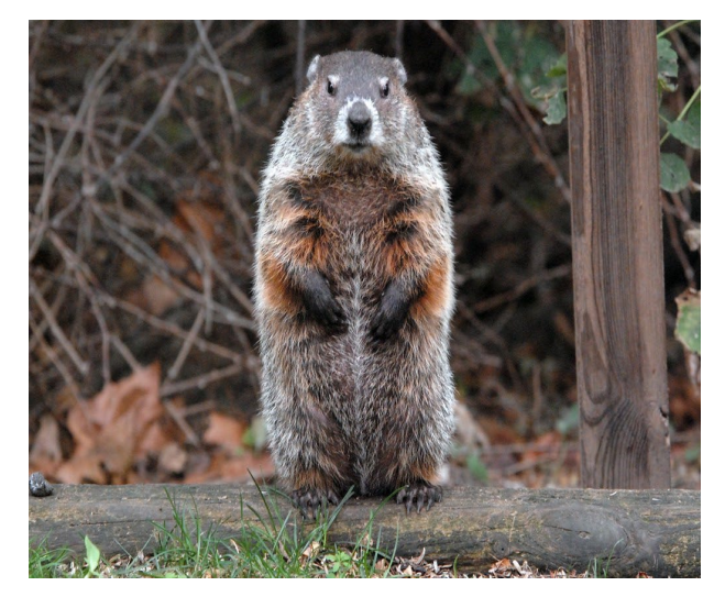
Figure 1. Physical appearance of the woodchuck. (<u>"Wood-chuck (Marmota monax)</u>, Potato Creek State Park IN DDZ_0068" by NDomer73 online at <u>https://wordpress.org/openverse/image/d1792f2e-95fa-4c5a-938c-55c82642aee0</u>, licensed under <u>CC BY-NC-ND 2.0</u>, <u>https://creativecommons.org/licenses/by-nc-nd/2.0/</u>.)

Woodchucks are adapted for living underground. Their eyes, nose, and ears all are aligned at the top of the head, which allows them to peek over the opening of their burrow to assess potential threats without exposing too much of themselves. Their short, powerful legs and clawed feet help them dig and climb into trees; it is not unusual to see a woodchuck resting on a large branch 10 feet up. At the first detection of a potential threat, they will race away into the protection of their burrow, but they will stand their ground and fight back using claws and teeth if cornered away from the protection of