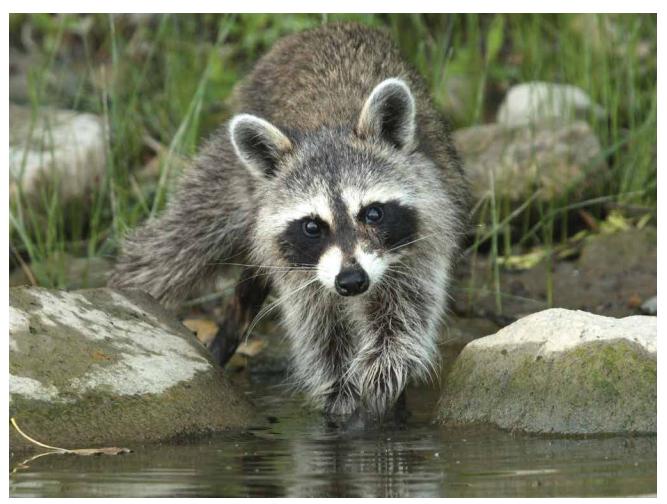
Figure 3: Raccoon exhibiting "dabbling" behavior.

Where water is accessible, raccoons often dampen food items before eating, a behavior that mistakenly has led people to believe that raccoons always wash their food (fig. 3). Interestingly, the German word for raccoon, "waschbär," which translates roughly to "wash bear," further illustrates this perception. Although this behavior of dousing food in water (called "dabbling") may enhance their sense of touch, washing is not mandatory. Where water is not available, raccoons typically just eat the item as found. Raccoons also possess an acute sense of smell and often are seen pressing objects to their noses to evaluate the scent. With these adaptations, raccoons are well-suited to eating a variety of food items and can survive in many different habitats.