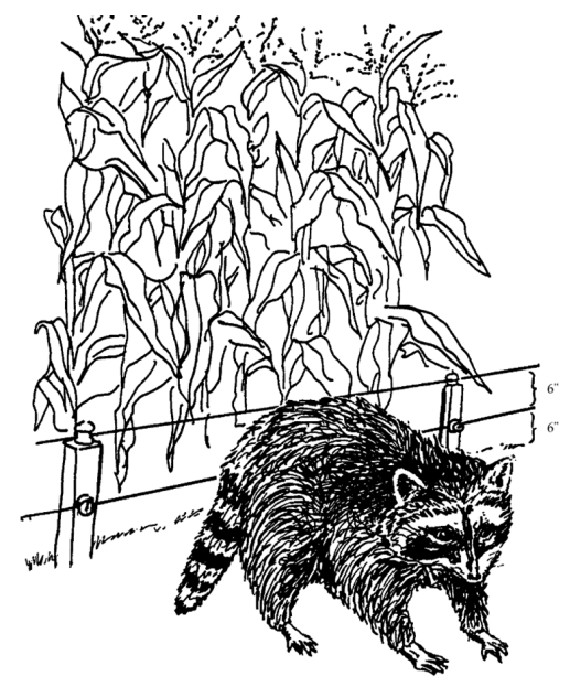
Figure 6: Image depicting simple electric fence option for deterring raccoons (Boggess 1994, C-103).

An option for protecting field crops or garden plots from raccoon damage is to install a wire mesh fence with openings less than 2 inches. To prevent raccoons from simply climbing over a newly installed fence, the top 12 inches of the fence should bend outward on supports that maintain a 45-degree angle or, where local ordinance allows, add one or two strands of properly insulated electrified wire at the top to deter entry from the top. Alternatively, two to four strands of electrified wire attached to insulated stakes can be installed around the perimeter of the garden or crop, where each wire is spaced no more than 6 inches apart and the bottom wire is 4-6 inches above the ground (fig. 6). If a fence already exists, a single strand of electrified wire can be mounted on top to provide additional protection. Installing mesh fencing across uneven topography can be difficult because gaps will allow raccoons to slip under. Before installing any type of fence, check to see whether local zoning restrictions/ordinances or your homeowners association covenant precludes the use of fencing.