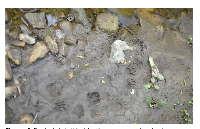
Figure 4: Footprints left behind by a raccoon after having walked in soft mud.

Many homeowners are fascinated to watch the backyard exploits of a raccoon, so they tolerate its presence as much as possible. However, most people are not aware that raccoons are present in their neighborhoods because these animals are primarily active at night and are initially cautious about approaching humans. When homeowners find signs of recent raccoon activity or presence, such as muddy paw prints (fig. 4) and droppings, they should be alert to the potential for conflict. Unless evidence of damage is present, leaving the raccoons alone and choosing to take no action, other than performing regular monitoring and eliminating all access to food sources, may be an appropriate option at this initial stage.