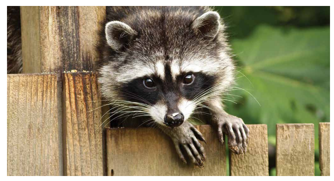
Figure 2: A raccoon is displaying its highly nimble front paws.

Raccoons are opportunistic, using their physical features to their best advantage. The five long toes on each paw are covered with short, smooth hairs on top but are hairless below, which improves the animal's ability to grasp and manipulate objects (fig. 2). A curved, nonretractable claw on each toe helps raccoons climb trees, forage for food in the dirt or inside tree cavities, capture small prey, and pry apart crustacean shells. The front paws contain a large number of sensory receptors and special hairs ("vibrissae") that enhance a raccoon's sense of touch and allow it to distinguish objects it cannot see. These sensitive forepaws allow the animal to search for food under water and discriminate edible from non-edible objects.