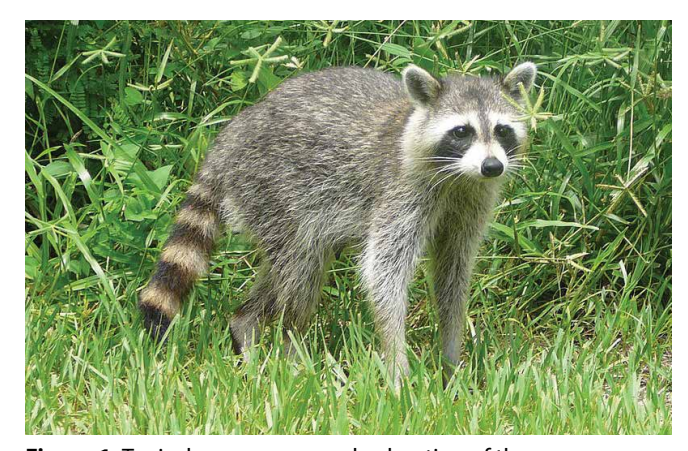
Figure 1: Typical appearance and coloration of the raccoon ( Procyon lotor ).

Raccoons are recognized by their distinctive markings, including their dark facial mask, which enhances their reputation of being "bandits," and their long, densely furred, and ringed tail (fig. 1). The facial mask — composed of dark fur that fully surrounds the eyes and a contrasting white border — serves several important functions. It projects an aggressive visual display that helps the raccoon defend territory and ward off predators. It is also believed to improve night vision by absorbing light or reducing lunar glare while the animal forages. In addition to their acute sense of smell and ability to distinguish vocalizations, raccoons may also be able to recognize or identify other individuals by the subtle but unique differences among masks and ringed tails.