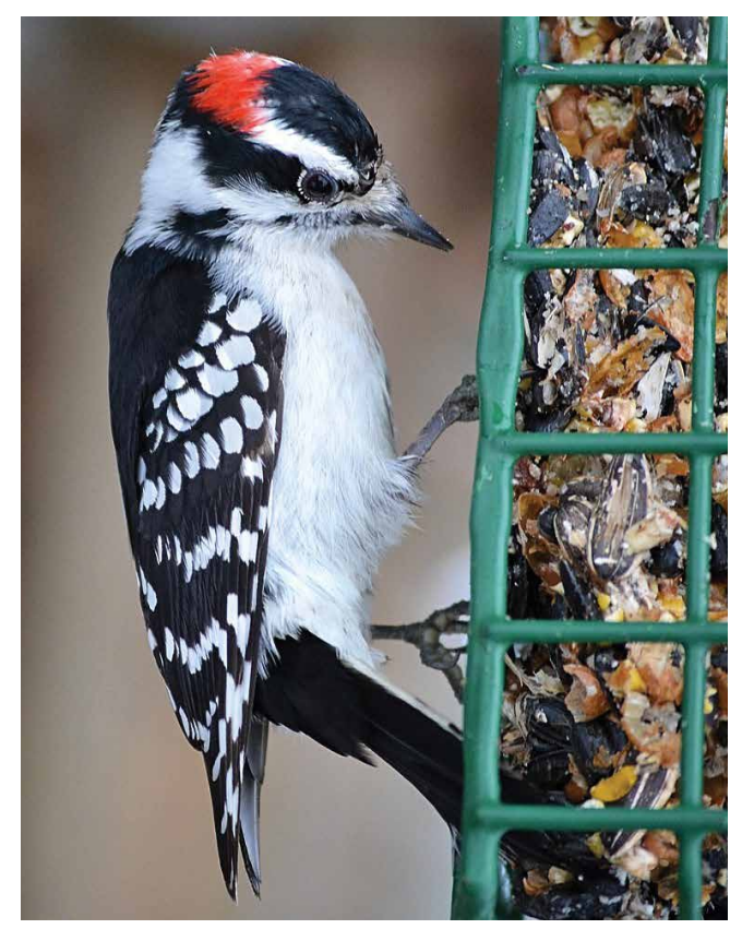
Figure 3: Downy woodpecker ( Dryobates pubescens ).

The toes of all woodpeckers are arranged uniquely when compared with most other common birds: two toes point forward, and two toes point backward (called "zygodactyl feet") (fig. 4). This arrangement aids them when they cling to the trunk and branches of a tree. All woodpeckers possess stiff tail feathers, which they use as a brace or support when climbing or clinging to the tree.