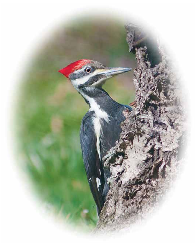
Figure 1: Pileated woodpecker ( Dryocopus pileatus ).

This publication provides information to improve readers' knowledge and understanding of these common birds and discusses various options designed to minimize negative consequences from our interactions with woodpeckers in Virginia.