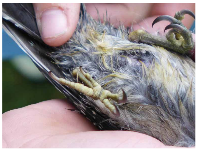
Figure 4: Photo of a woodpecker's zygodactyl feet.

Female woodpeckers typically lay three to six eggs that will hatch in approximately 14–20 days. Given this short incubation period, many species of woodpeckers produce multiple broods each year. Woodpeckers are classified as requisite cavity-nesters, and as such, they typically create a new cavity with each breeding effort.