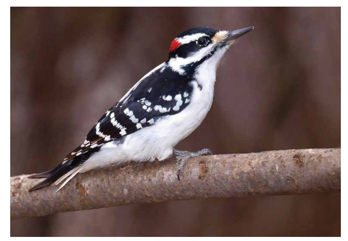
Figure 2: Hairy woodpecker ( Dryobates villosus ).

Size among woodpecker species ranges from about 6 1/2 inches tall in the diminutive downy woodpecker to as much as 17-20 inches tall in the large pileated woodpecker. Overall, our resident woodpeckers are characterized either by various patterns of black and white (some with red on or near the head) or a mix of gold/yellow, brown, white, and black, often with small patches of red. Despite this considerable variation in appearance among the woodpeckers — can be difficult to distinguish. The hairy woodpecker is larger overall and has a noticeably longer and stouter bill than the downy woodpecker.