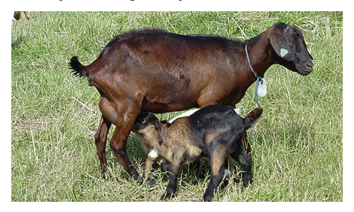
Figure 5. Spanish doe nursing twins.

For spring kidding/lambing, females should be bred in late September, October, and November for kidding/lambing starting in late February through April. This system coincides more with the natural mating and kidding/lambing seasons and, due to this, a greater offspring crop can be expected. All things considered, a lamb/kid crop of 150% (sheep) to 180% (goats) should be the goal. Ovulation rates and male fertility are at a peak during fall breeding and embryo loss should be minimal due to cooler temperatures. However, under this system, offspring won't be ready for market until later in the season and possibly on pasture where internal parasites might be a problem.