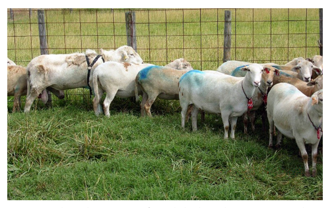
Figure 1. A breeding group of Katahdin hair sheep.

A purebred animal is a member of a specific breed that possesses similar characteristics/traits and shares common ancestry. Pure-breeding is the mating of females and males within the same breed or type. Figure 1 provides an example of a purebred breeding group of Katahdin hair sheep. These animals are eligible for registration in associations for that breed. While there are pros and cons to pure-breeding, the major goal is to provide animals with superior genetics for marketing to other purebred or commercial producers. Purebred animals can be sold at higher prices and therefore offer a chance for increased profitability.