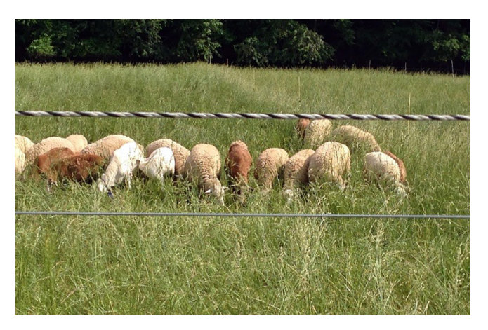
Figure 3. Purebred and crossbred (Dorset-sired) landrace hair sheep lambs grazing on pasture.

In addition to hybrid vigor, crossbreeding systems offer breed complementarity. For example, producers frequently breed hair sheep ewes to larger, heavier muscled ram breeds, such as a Suffolk, to obtain market animals that are hardier and faster-growing, and which also can meet market needs. In doing this, they are taking advantage of the qualities in both the maternal and paternal breeds: the hair sheep ewe's traits of good mothering ability, no shearing requirements, and/or tolerance to heat and parasites, and the Suffolk ram's traits of fast growth rate and muscling.