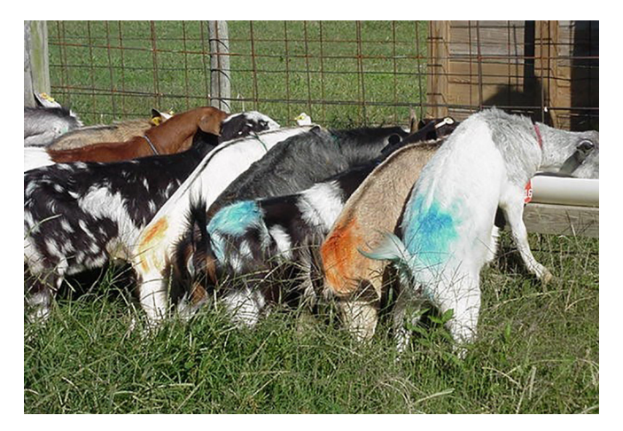
Figure 2. A group of Spanish and Myotonic females eating at a fence line feeder.

animals would carry the same undesirable traits. It is also the most widely used mating system by purebred/seedstock and commercial producers.