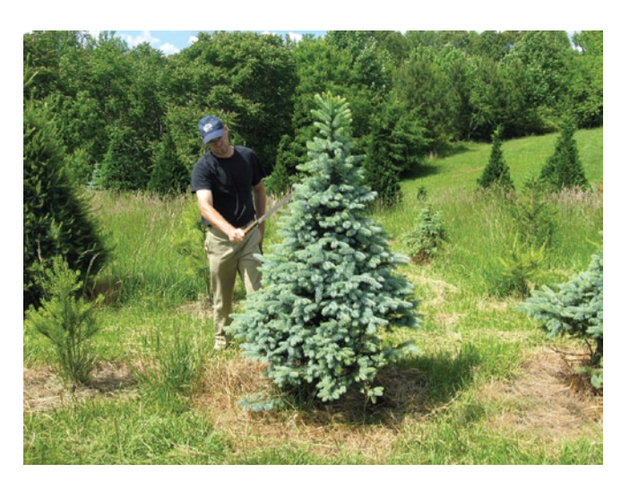
Figure 3. Regular maintenance operations, such as shearing, must be performed in order to produce high-quality and marketable Christmas trees. Shearing can be done using hand tools (as shown) or with motorized tools.

Fourth and subsequent years: Apply 4 to 5 fluid ounces of 10-10-10 per tree by covering the entire 3-foot-wide band between trees.