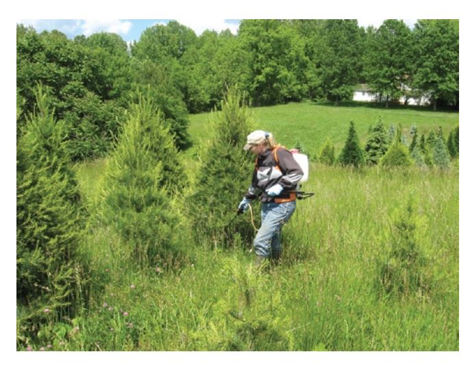
Figure 2. Spraying a herbicide in a 3-foot radius around growing Christmas trees can control vegetation, which prevents it from removing water and nutrients from the soil that could be otherwise utilized by the Christmas trees.

The first year is an especially critical time for tree establishment. On properly selected sites, trees will seldom die once they survive the first year. With good site selection, tree planting techniques, and weed control, growers should expect 80 percent to 90 percent survival. Trees that die should be replaced during the second year.