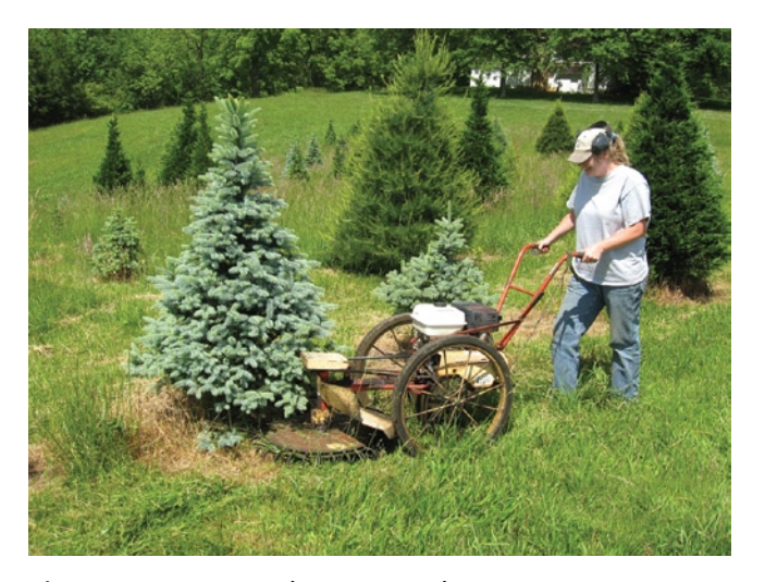
Figure 4. A motorized mower, as shown, is an asset to any Christmas tree operation. It can aide control of vegetation in and around the growing trees, and it can be used by the grower to clear alleys and walkways so as to maintain easy access to all areas of the production site.

Revenue from the sale of Christmas trees depends on market conditions, quality of trees, and method of selling. If trees are planted on a 7-foot by 6-foot spacing (1,050 trees per acre), 60 percent of the trees survive and become merchantable, and the wholesale price for trees cut and stacked by the buyer is $15 to $20 per tree, the grower will earn about $10,000 to $12,000 per acre over a seven- to 10-year period. Good growers who increase their harvest efficiency to 80 percent and produce more valuable species such as spruce or fir, which sell for as much as $25 per tree, can earn up to $15,000 per acre. Furthermore, if the grower sells his trees on retail lots, he may earn an additional 50 percent.