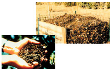
Backyard compost bin (top) and mature compost.

Decomposition is performed by naturally occurring microorganisms (e.g. bacteria, fungi) that utilize the organic materials for their food and energy sources. Proper primary composting involves temperatures between 110 and 150°F, moisture content between 50 and 60%, and adequate oxygen for