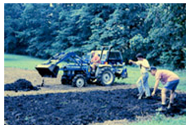
Landscapers use compost for soil building.