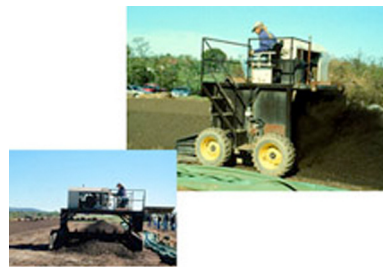
Windrow turner--mixes and aerates compost.