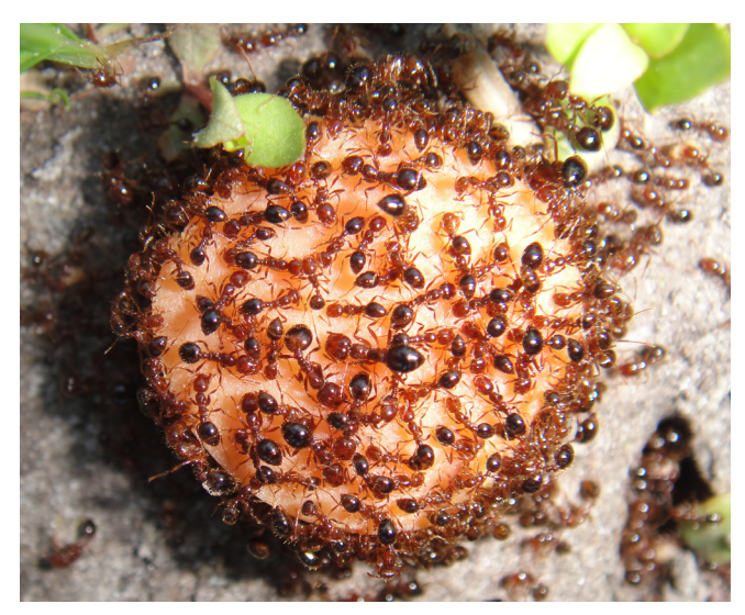
Polymorphic (variable size) fire ant workers feeding on a hot dog.

You can distinguish RIFA from other North American ant species by using a microscope to verify the following characteristics. First, each antenna has ten segments (starting at the head). The last two segments will be larger than the others, forming a two-segmented club. The pedicel (the skinny "waist" connecting the front of the body to the gaster) has two segments. Finally, the tip of the gaster has a sharp stinger that is easily visible with the aid of a microscope.