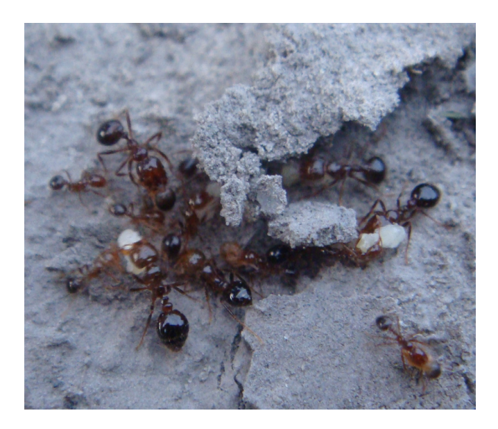
Fire ant workers transporting brood (eggs, larvae, pupae) to a new mound.

Reproductive swarms of virgin queens and males occur during the spring or summer but can occur at any time of year when the temperature is above 72°F. Healthy nests often produce two or more nuptial flights a year. It is typical for many RIFA colonies to participate in simultaneous nuptial flights when local weather conditions are favorable. Flights most often occur during the midmorning, one or two days after a rainfall. Most nests produce both male and female reproductives (swarmers). But the swarmers from a single flight from a single nest are predominantly one sex. Males emerge first and are already airborne