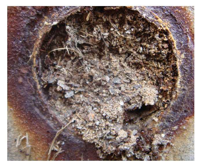
Fire ant nest inside of drainage pipe; Richmond, Va.

RIFAs rarely nest indoors, but if they do, you should call a professional pest control operator immediately. It is more typical of RIFA to establish nests next to or under sidewalks, roadways, and other outdoor structures. If the nest site is later abandoned, the soil may shift, causing cracks or occasionally the collapse of the sidewalk.