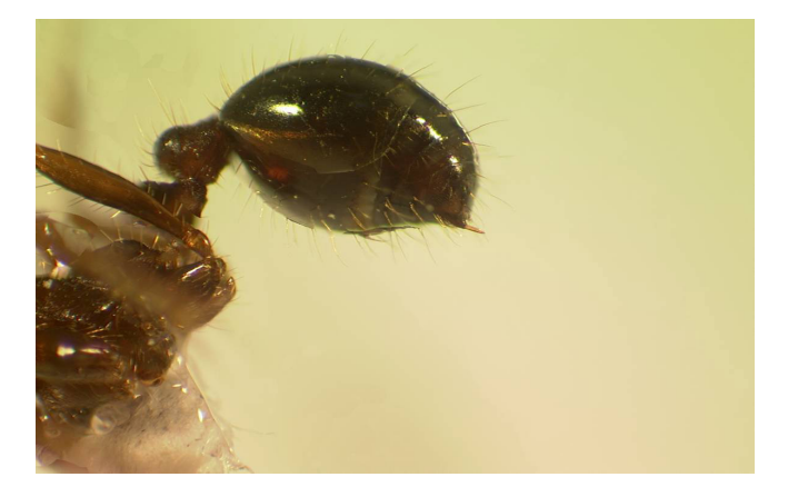
The fire ant stinger.