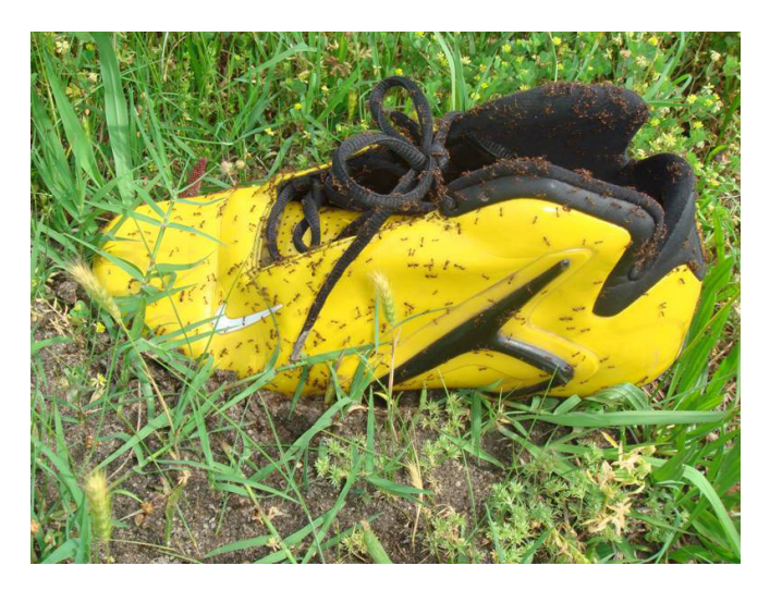
Fire ant response to their mound being stepped on.

It has been documented that RIFA tend to enter structure during periods of heavy precipitation. RIFAs in structures can be very dangerous for small children or the elderly. A number of deaths have resulted from children or bedridden elderly adults being stung repeatedly by fire ants. Nursing homes and day care centers need to be particularly diligent about keeping fire ants controlled both indoors and out.