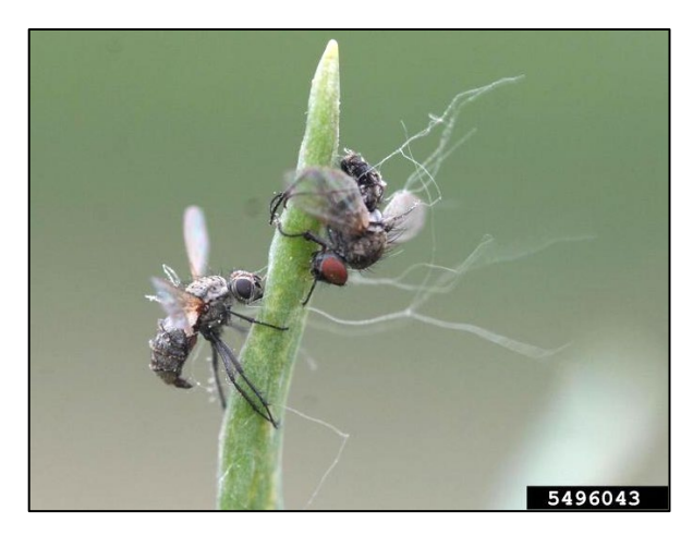
Fig. 3. Anthomyid flies similar to Delia spp. killed by insect-killing fungi (Whitney Cranshaw, Colorado State University, Bugwood.org).

Each spring, seedcorn maggot flies are infected with a type of insect-killing fungi. The infected flies seek out stems of small grains, dogwood twigs, or other flowers that allow them to climb to a high point. The flies settle on the plant where they eventually die as a result of the fungal infection (Fig. 3). These infected flies are sometimes seen stuck to windows, glued there by the fungus.