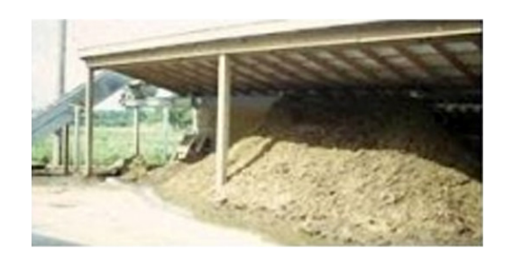
Figure 2. Types of manure storages (clockwise from top left): aboveground steel tank for liquid or semiliquid manure, aboveground concrete tank for liquid or semiliquid manure, earthen pond for liquid or semisolid manure, and stack shed for solid manure.