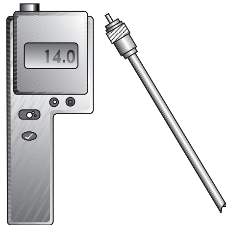
Figure 2. Electronic conductance moisture tester and probe.

Electronic conductance moisture testers provide an instantaneous moisture concentration reading. Most electronic conductance testers have a sensing probe and a hand-held display unit (Figure 2). The electrical resistance of the forage is measured between two metal contacts at the tip of the probe when inserted into the forage. Testers determine forage moisture concentration based on the relationship between moisture concentration and electrical conductivity.