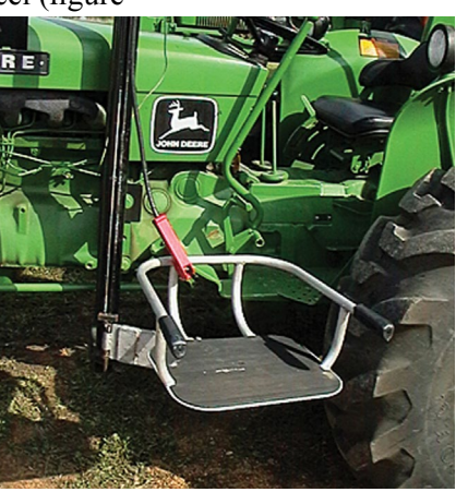
Figure 2. Left, tractor retrofitted with additional steps; right, tractor equipped with mechanical lift.