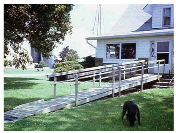
Figure 7. Ramp for improving wheelchair access.

Living space is often modified using appropriate ATs to protect farmers with disabilities from secondary injuries. These modifications may include adding ramps (figure 7) for wheelchair access, improving lighting in areas frequented by individuals with disabilities, and replacing doorknobs with lever handles for a better grip.