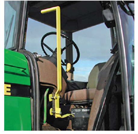
Figure 3. Hand-control linkage for operating the clutch.