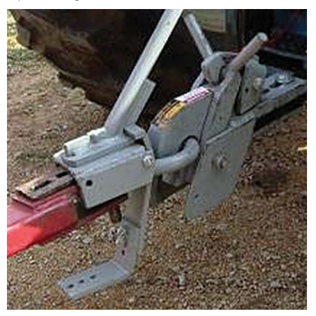
Figure 6. Quick connect adaptor for attaching and detaching implements to the drawbar.