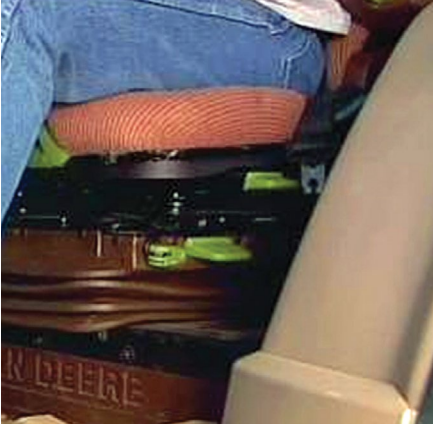
Figure 5. Retrofitted tractor seat for protecting operators with certain disabilities.