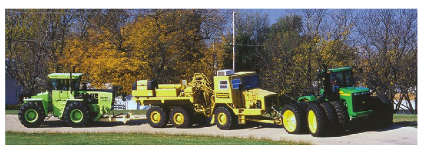
Figure 2. The lead tractor is being tested on the track during drawbar performance tests. The two vehicles in tow are load units.

1. The first format is a booklet (4 inches by 6.5 inches) published annually with limited performance data on all tractors available for sale in Nebraska that year.