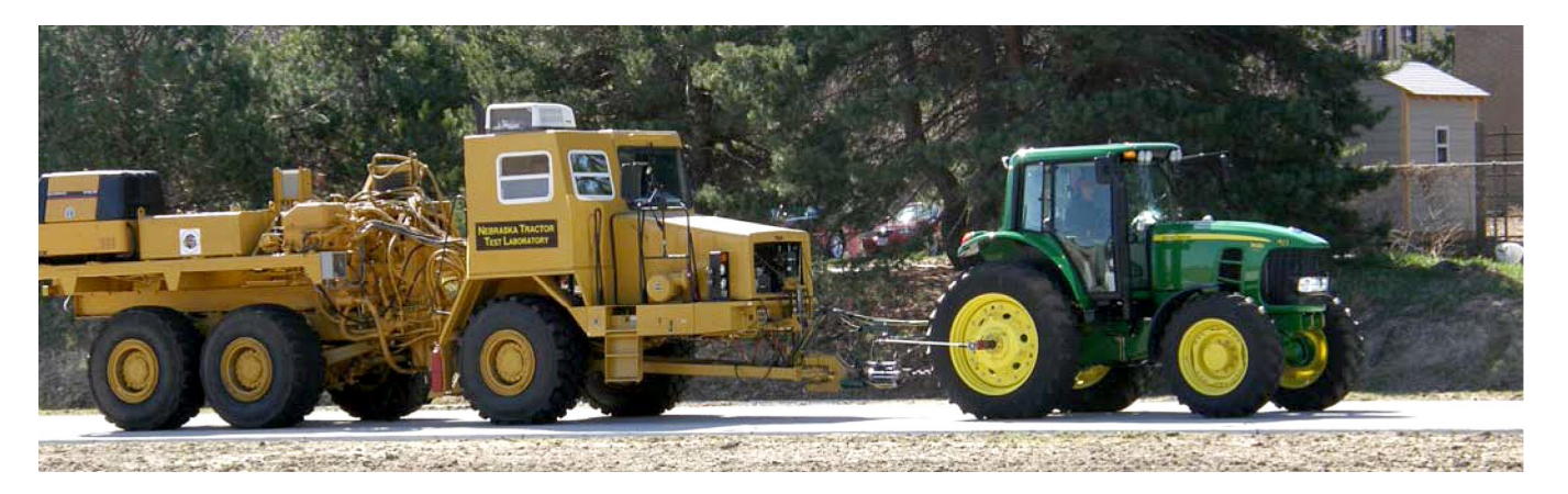
Figure 3. A tractor running on the test course. The drawbar performance test is being performed.

The summary booklet includes approximately 400 tractor models from different manufacturers.