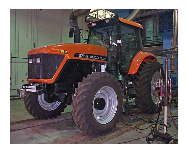
Figure 1. A tractor being tested on the PTO dynamometer. The test apparatus in the foreground is measuring fuel flow.

Drawbar performance tests (figs. 2 and 3) are conducted in all gears between a lower gear below the one that provided maximum drawbar force (without exceeding a wheel slip of 15 percent) and a maximum speed of 10 miles per hour. Using each gear at full throttle, the load is increased until maximum drawbar power is achieved. Engine speed, wheel slip, and fuel-consumption data are recorded when test conditions are stabilized.