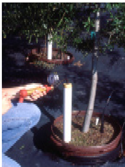
Fig. 2. Vacuum being drawn on a suction cup lysimeter in a 15 gallon in-ground container.