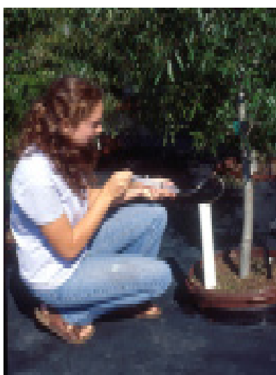
Fig. 3. Removing substrate solution from lysimeter with syringe.