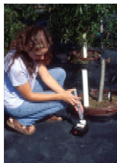
Fig. 4. Dispensing substrate solution in EC/pH meter.