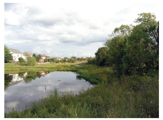
Figure 1. Typical wet pond (VA-DCR 2011).

Wet ponds (WP) are ponds or lakes which provide treatment and storage of stormwater . The water depth is set by a structure known as an outlet structure . Wet ponds are probably the most well-known best management practice for treatment of stormwater. Because of their size, they are usually designed to include storage above the normal pool elevation. This added storage can provide reductions in downstream flooding and assist in protecting stream channels. They tend to be large and in some cases, they can become a passive community amenity (See Figure 1).