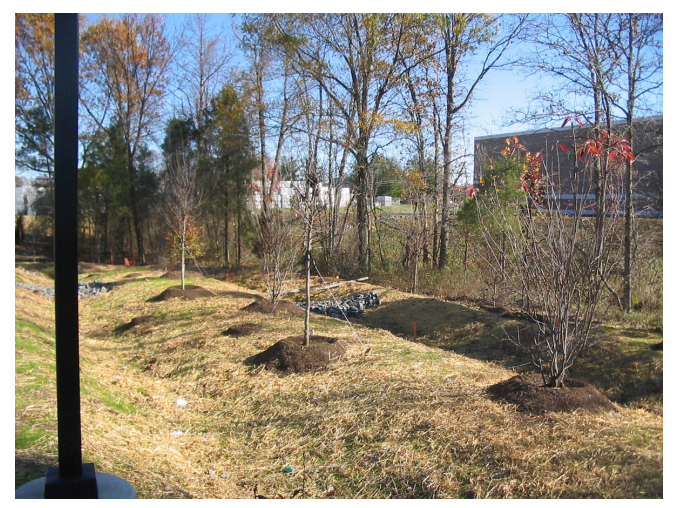
Figure 1. Typical dry swale just after construction.

A dry swale (DS) is a shallow, gently sloping channel with broad, vegetated, side slopes. Water flow is slowed by a series of check dams (see figure 1). A DS temporary storage, provides filtration, and infiltration of stormwater. Dry swales function similarly to bioretention, and are comparable to wet swales; how-ever, unlike a wet swale, a DS should remain dry during periods of no rainfall. A DS is an engineered best man-agement practice (BMP) that is designed to reduce pol-lution through runoff reduction and pollutant removal and is part of a site's stormwater treatment practice (see figure 2).