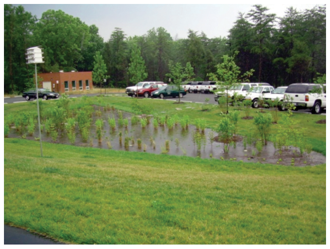
Figure 1. A sample bioretention cell or rain garden.

A bioretention cell, or rain garden, is a best management practice (BMP) designed to treat stormwater runoff from roofs, driveways, walkways, or lawns. They are a shallow, landscaped depression that receives, temporarily holds and and treats polluted stormwater with the goal of discharging water of a quality and quantity similar to that of a forested watershed (figure 1).