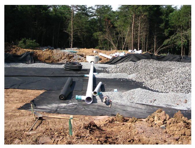
Figure 1. Construction of an infiltration basin.

Infiltration practices provide temporary surface and/ or subsurface storage, allowing infiltration of runoff into soils. In practice, an excavated trench is usually filled with gravel or stone media, where runoff is stored in pore spaces or voids between the stones (see figure 1). These systems can reduce significant quantities of stormwater by enhancing infiltration, as well as provide filtering and adsorption of pollutants within the stone media and soils. Infiltration practices are part of a group of stormwater treatment practices , also known as best management practices (BMPs)