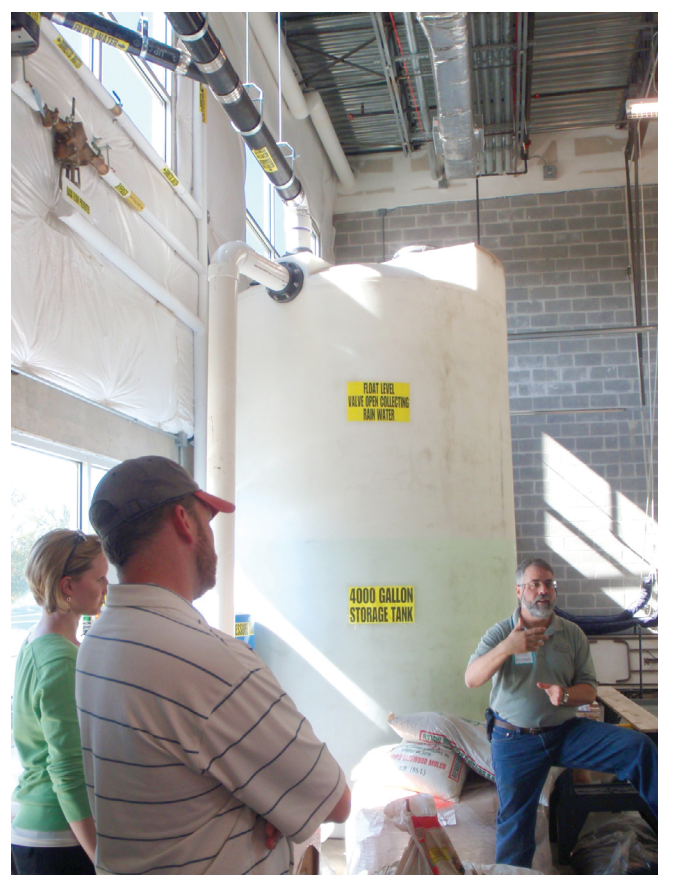
Figure 1. Typical RWH system.

RWH can be used to collect runoff from any impervious area, although roofs are generally the preferred site. Collected runoff can be used for either outdoor or indoor use. Collecting runoff from other impervious surfaces , such as driveways and parking lots, is discouraged due to a much higher level of contamination and pollution. RWH can be used in a variety of urban settings; however, periodic maintenance is required. Underground tanks can be installed, but they have to be adequately supported for the anticipated structural loads placed over them.