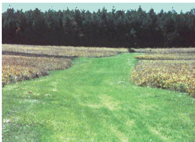
Figure 1. Typical vegetated filter strip (EPA 2009).

Sheet flow to open space (SOS) is a group of best management practices (BMPs) designed to disperse concentrated runoff to sheet flow into filter strips or a riparian buffer. An SOS reduces runoff volume and associated sediment and nutrients that are carried with it (see figure 1). It is used as a stormwater treatment practice in both urban and rural areas. This practice is often used after another treatment practice to disperse or eliminate runoff. In a few cases, an SOS can be used as a pretreatment to remove small amounts of sediment via a vegetated filter strip — prior to a bioretention device, for example.